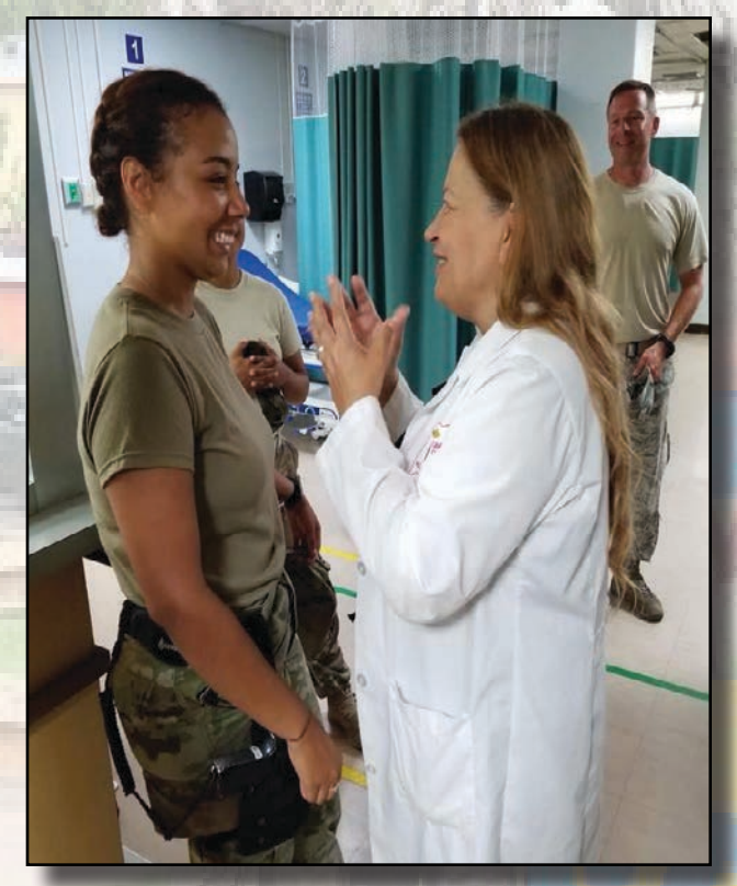
442 MP Co. Soldiers served a vital role by helping to keep the peace so local workers could focus on their jobs.

The 442nd Military Police Company conducted humanitarian aid and security missions across the Island of Puerto Rico to help the victims of Hurricane Maria.