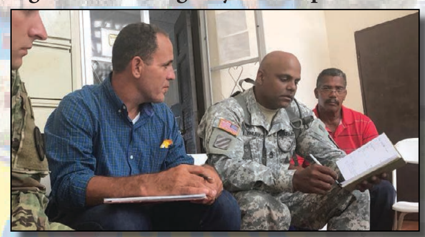
They utilized and secured mission-essential equipment.

Soldiers with the 442 MP Co. worked hand-in-hand with local government agents and emergency service personnel.