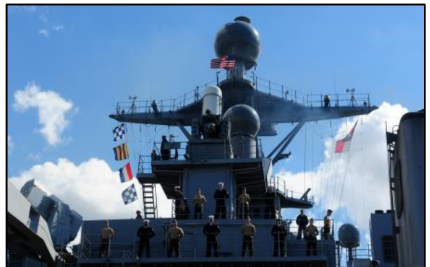
Sailors assigned to the forward-deployed amphibious dock landing ship USS Germantown and Marines of the 31st Marine Expeditionary Unit participated in Talisman Sabre '11.