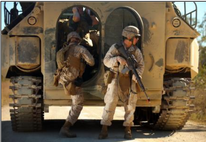
Marines with Company G, Battalion Landing Team 2nd Battalion, 7th Marines, 31st Marine Expeditionary Unit, climb into the back of an amphibious assault vehicle after providing security for a scenario-based exercise during Talisman Sabre 2011.