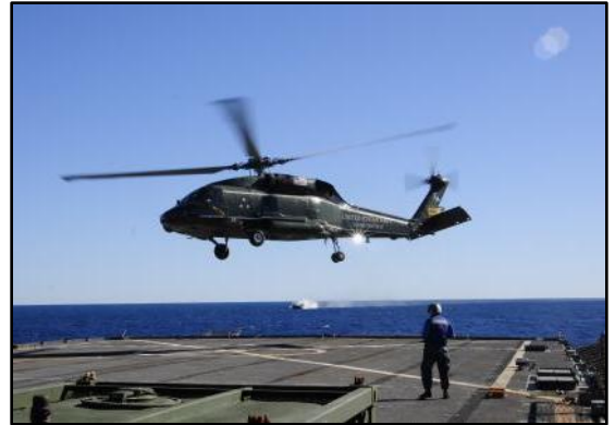
An MH-60 Sea Hawk departs from the flight deck of the forward-deployed amphibious dock landing ship USS Germantown