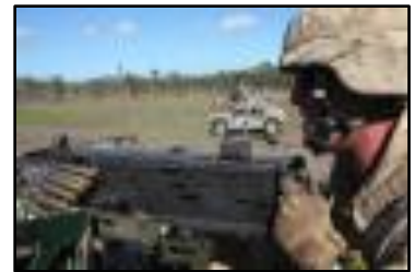
U.S. Marines conducts a live fire range during Talisman Sabre 2011