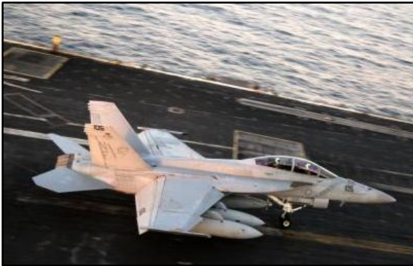
An F/A-18F Super Hornet from Strike Fighter Squadron 102 taxis down the flight deck of the aircraft carrier USS George Washington.