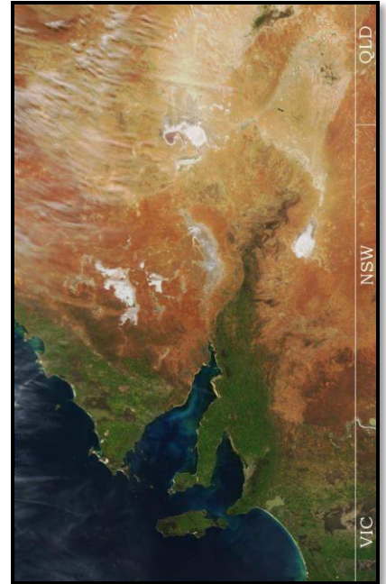
Satellite image courtesy GoogleEarth

have been fully integrated in a Talisman Sabre exercise, with components from the U.S. Army and Air Force and the Royal Australian Air Force.