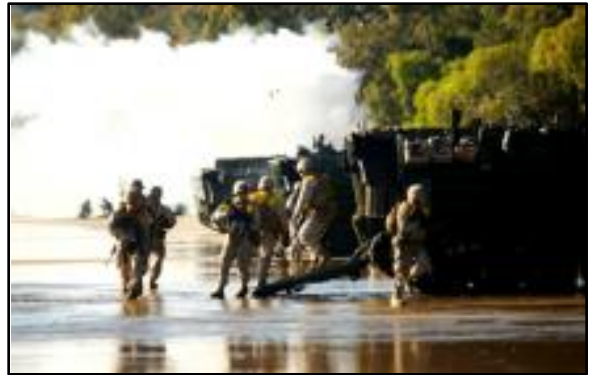
Marines from the 7th Marines, 31st Marine Expeditionary Unit, conduct an amphibious assault during Talisman Sabre.