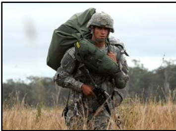
U.S. Army Soldier conducts field training during Talisman Sabre 2011