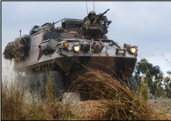
An Australian light armored vehicle transits through Shoalwater Range in Shoalwater Bay Training Area.