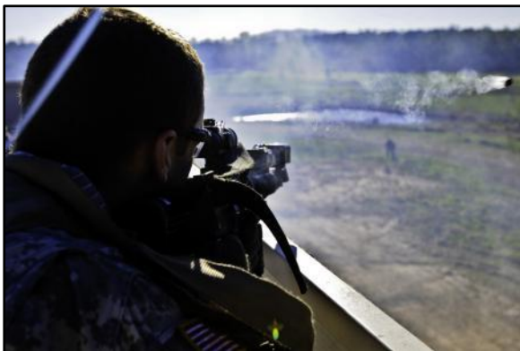
A Charlie Company, 2nd Inf. Bn, 23rd Inf. Reg, 4th Stryker Brigade, 2nd Inf. Div., defends against Australian soldiers from 7th Brigade at the Urban Operations Training Facility during Talisman Sabre 2011.