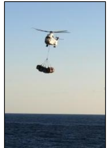
A 330J Puma helicopter assigned to the dry cargo/ammunition ship USNS Richard E. Byrd transports pallets of supplies to the forward-deployed amphibious dock landing ship USS Germantown.