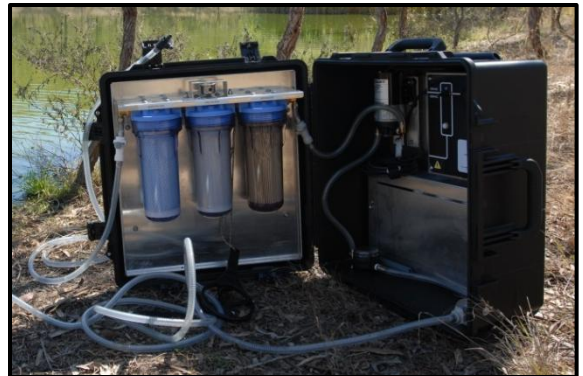
Photo Left: Capt. Ashton Carter, an Air Force biologist from the research labs at Wright-Patterson Air Force Base, brought a prototype of the Seldonwaterbox, a portable water filtration device, to the Shoalwater Bay Testing Area for tests with the Australian military during Exercise Talisman Sabre.

Photo Left inset: The makers of the SeldonWaterbox, a portable water-filtration device claim their carbon nanotube filters can remove 99.9999% of bacteria and 99.99% of viruses from any freshwater source, as shown in the before and after shot.