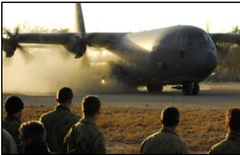
Using U.S. Air Force C-17s (above) U.S. Army paratroopers from the 1st Battalion, 501 Inf. (Airborne) conducted a strategic airborne assault into the Kapyong drop zone, Shoalwater Bay Training Area, Australia (Right)