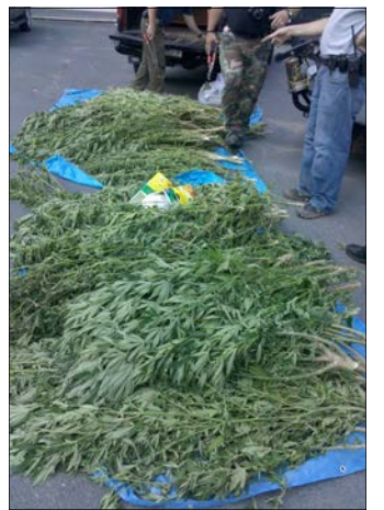
LEA officers count their "score" after OH-58 supported ERAD missions in late July of this year.

The FY10 season has been OUTSTANDING!! NYNG CDTF was able to acquire more funding for fuel, thus increasing our flight hours. By mid-August, we have exceeded FY09's seizures with over 2900 plants, several pounds of processed MJ and weapons, and we have four weeks remaining in the schedule. Also, all pilots were able to attend the CD Doctrinal Training course, as per NGR 500-2. We have also increased our mission-readiness rate.