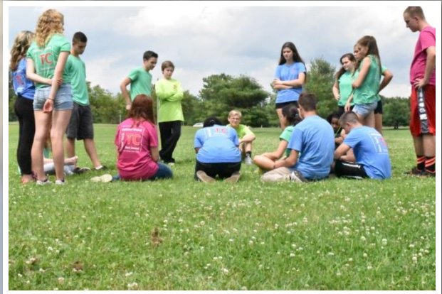
Team Building at The Crossings<sup>3</sup> in Colonie