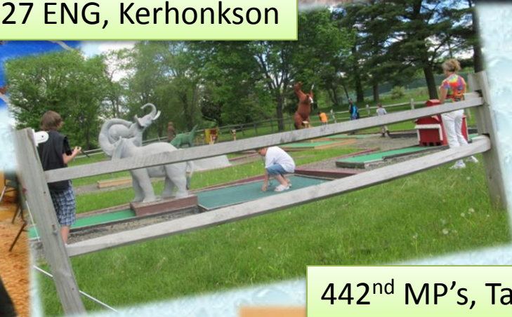
442 nd MP's, Tarrytown