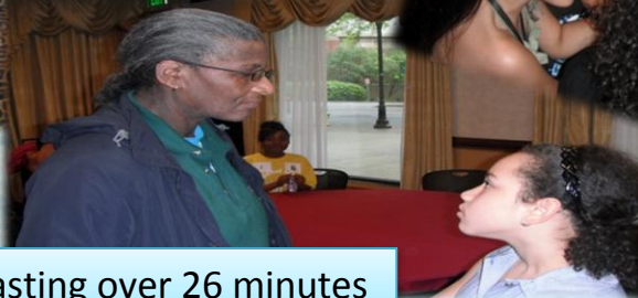
Staring contest lasting over 26 minutes