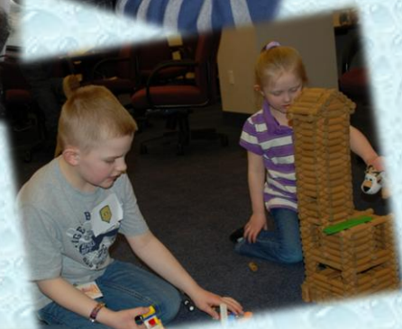
827 ENG, Buffalo