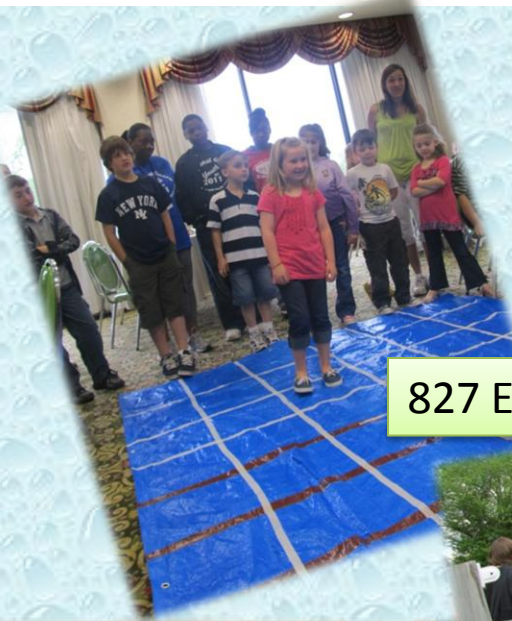
827 ENG, Kerhonkson