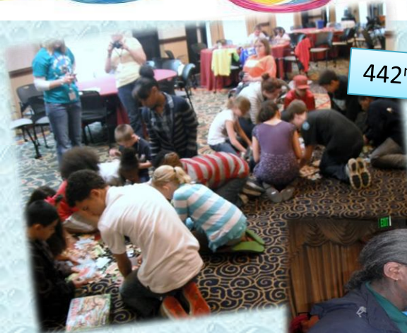
442 nd MP's, White Plains