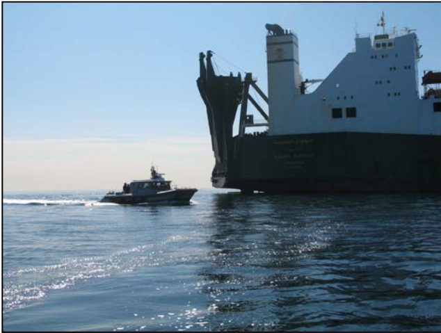
In support of the U.S. Coast Guard commercial vessel inspection program. A Naval Militia patrol boat with a Coast Guard boarding team meets a Saudi freighter off the coast of Long Island.

It is the naval component of New York State's military forces. As part of the New York State Division of Military and Naval Affairs, the Naval Militia complements the Army and Air National Guard programs, as well as the New York Guard. We provide support for natural or man-made disasters, technological disasters, and homeland security.