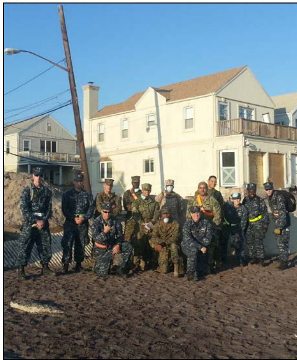
Civil Support Operations at Rockaway