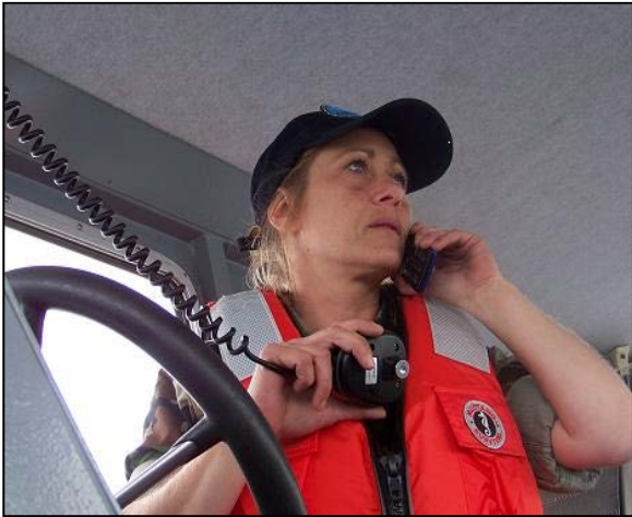
Coordinating underway operations at Rochester