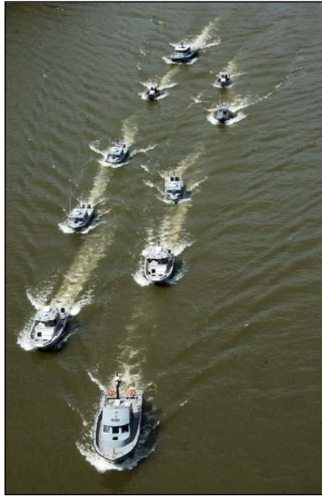
Operating on the Hudson River

Many employers allow members to use their Military Leave for State Active Duty.