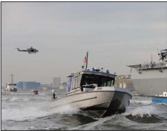
Naval Militia patrol boat escorts USS NEW YORK (LPD-21)