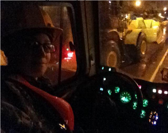
Responding to 2014 Snow Storm in Buffalo