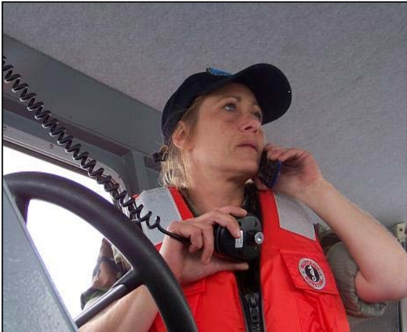
Coordinating underway operations at Rochester