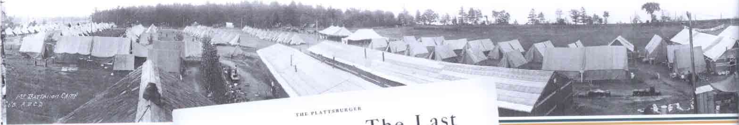
Tents of the 1st Battalion camp, August, 1915.

An estimated ninety percent [of Plattsburgers] subsequently saw military service during World War I, most of them as line officers.