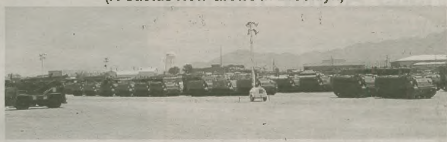
Armored personnel carriers and other assorted vehicles from South Carolina's 218th Mechanized Infantry Brigade line up in an assembly yard at Yermo Marine Corps Logistics Base after rail download. The 206th coordinated the off-load of more than 500 rail cars of the brigade's equipment for a rotation to the National Training Center.

that will be the model for all future NTC deployments for the Army National Guard."