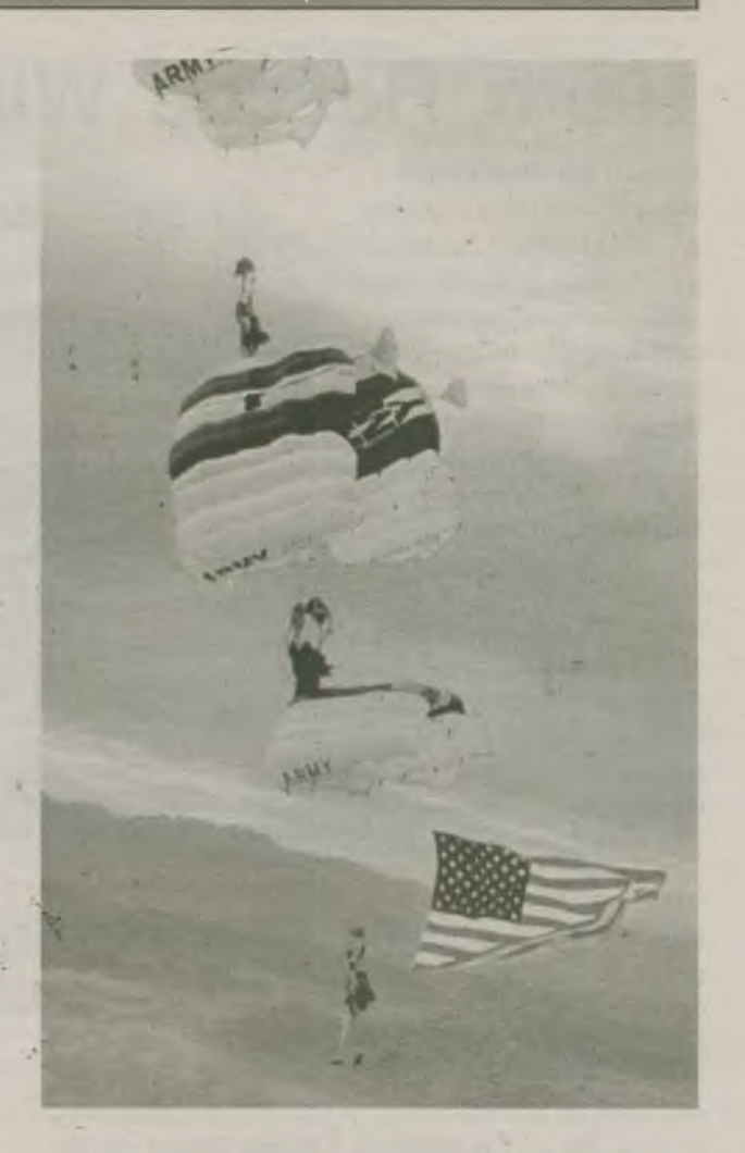
The Army's Golden Knight precision parachute jump into the LI Airshow Spectacular stacked 3-high.

Beyond the Thunderbirds, Golden Knights and Volunteers, there were static displays of military equipment, more musical entertainment, food and refreshments. The local Long Island newspaper Newsday presented the airshow and sponsors included the Parks Office, Natural Heritage Trust, Radio Station WALK, Petillo Prime Meats and the Foundation for Long Island State Parks. Corporate contributors include Irish Coffee Pub, Kikkoman, Naudus Communications, Long Island.com and Long Island Jet Center, Inc.