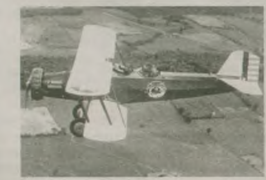
A Douglas O-38, flown by the 102nd Observation Squadron during the 1930s.

After World War I, many WW I veterans and other aviation enthusiasts worked to reestablish an aviation unit in New York. In November 1922, the 102<sup>nd</sup> Observation Squadron, attached at the time to an infantry unit in Mineola, NY was federally recognized. It has had an unbroken record of service ever since.