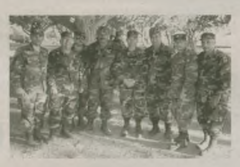
Command and staff of the 206th CSB pause from the summer heat with Brig. Gen. Louis Brown (center), commander of the 218th Mech Infantry Brigade. Courtesy Photo.

The transportation companies moved supplies and equipment between Ft. Irwin and Yermo, requiring the support operations