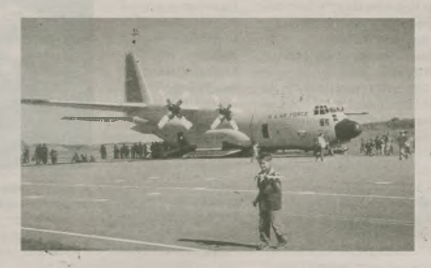
One of the Boy Scout spectators at the Schenectady County Airport "Odyssey of Aviation" marvels at the 109th Air Wing's LC-130.

space Museum, a New York Army National Guard Black Hawk helicopter from the 3<sup>rd</sup> Battalion 142<sup>nd</sup> Aviation in Latham and a New York State Police helicopter were also on display. Over the weekend, scouts built rockets, raced through obstacle courses, flew kites and toured the aircraft on display.