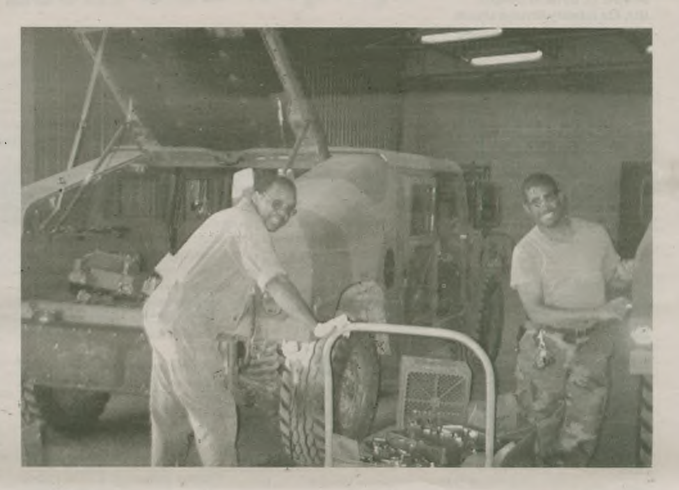
Soldiers from the 53rd Troop Command prepare to install new radio installation kits and Single Channel Ground and Airborne Radio System (SINCGARS) radios in a M998 HMMWV vehicle at Camp Smith, New York. The SINCGARS radio provides much greater communications capabilities by frequency hopping during transmissions. The units provided manpower and expertise to upgrade more than 300 vehicles and 500 radios for the 27th Enhanced Separate Infantry Brigade and Troop Command units.

Soldiers installed close to 500 radio systems in almost 300 vehicles from June to August this year. This was truly a cooperative effort. The team's efforts and the assistance of State Headquarters, Camp Smith Training Site, CSMS A, the 27th Brigade, the 42d Infantry Division, and all the units of the 53rd Troop Command ensured the success of this mission.