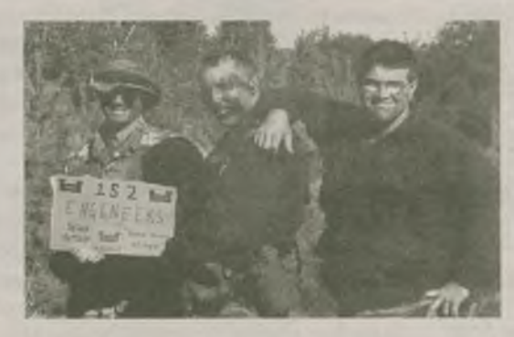
"Satan's Sappers" worked alongside the 69th Infantry OPFOR during this summer's Exercise Empire Peak.

Personnel Carriers of the 152d Engineers maneuvered alongside M3 Bradleys and M1A1 tanksfrom E-31 Cavalry at Fort Drum during Exercise Empire Peak. The sappers provided obstacle and mine clearance as well as defensive preparations to the brigade's critical sites.