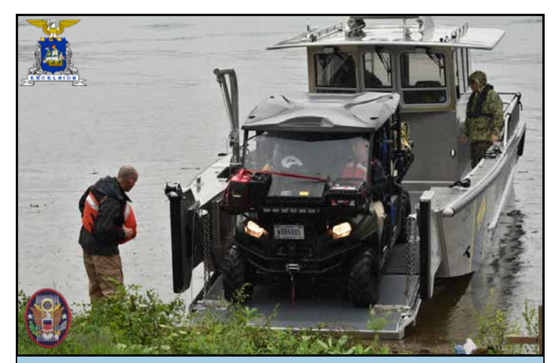
Members of the New York National Guard's 2nd Civil Support Team unload an ATV from the New York Naval Militia's new landing craft, LC-350, during a joint training exercise conducted on the Hudson River in Rensselaer, New York on August 17, 2018. The Naval Militia Sailors and CST members were testing the ability of the boat to load and unload the ATV, used by CST chemical, biological and radiological survey team members, on the shore.

The LC-350 has a catamaran twin- hull design which increases stability. It also has the ability to pivot 360 degrees when needed. 9 .