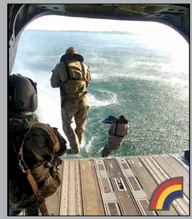
BUFFALO, N.Y. -- Members of the West Virigina Army National Guard's 19th Special Forces Group (Airborne) exits a CH-47 Chinook assigned to New York's Bravo Company, 3rd Battalion 126th Aviation, over Lake Erie on Sept. 5, 2018. The New York aircrew assisted the Special Forces Soldiers in helocast training.