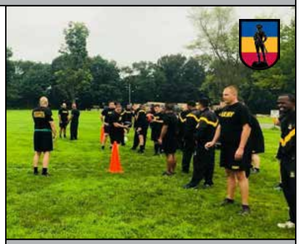
New York Army National Guard Soldiers taking part in the seven-day Tactical Athletes Course, designed to help them pass the new Army Combat Readiness Test, prepare to execute a test at Camp Smith on August 11, 2018. Thirty Soldiers from across the state took part in the pilot program run by the 106th Regional Training Institute.

Even after the course ended the participants were hitting their local gyms and were continuing to work together to stay motivated and had created a Facebook page to help them share, since they live across the state, he added.