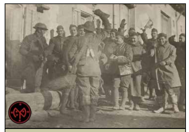
New York Soldiers of the 27th Division celebrate the signing of the Armistice that ended World War I on Nov. 11, 1918. The division had suffered heavy casualties while attacking through the Hindenburg Line as part of the British Fourth Army.

The Meuse-Argonne Offensive was bigger than the World War II Battle of the Bulge in which 500,000 Americans fought, or