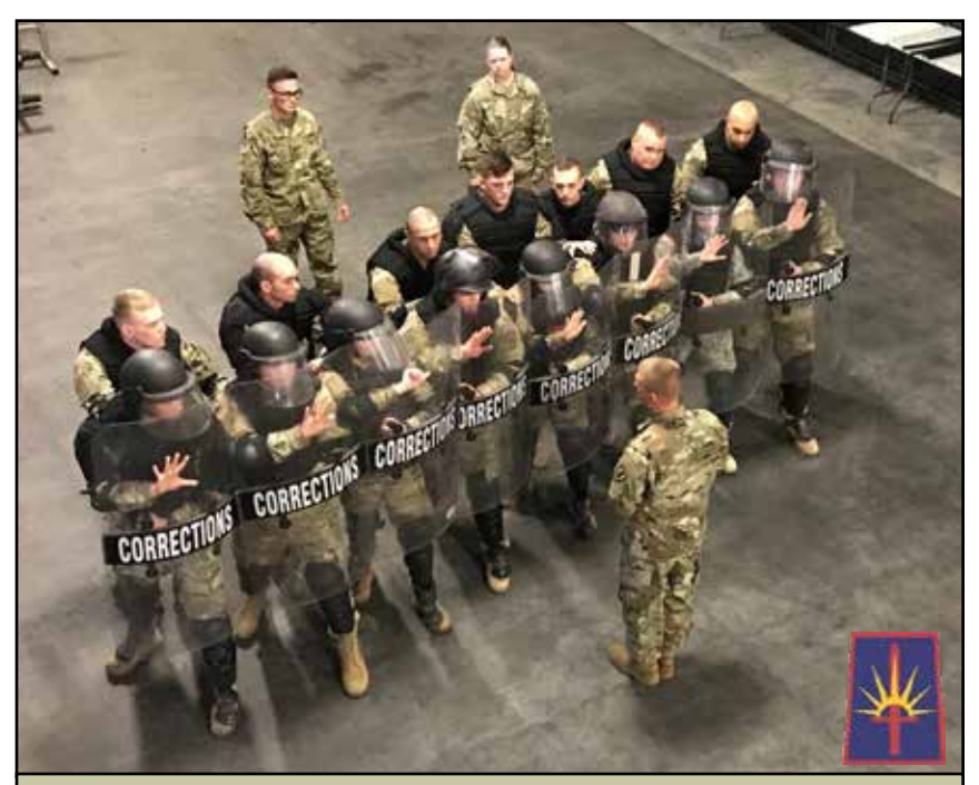
New York Army National Guard Soldiers assigned to Headquarters and Headquarters Company of the 102nd Military Police Battalion, conduct riot control training at Fort Leavenworth, K.S., June 7, 2018. The Soldiers were conducting joint training with the 705th Military Police Battalion.

"This allowed them to have better insight on what exactly their role is inside the facility. A lot of our training at home station is MP oriented, but this training showed the support MOS's just how critical they are for our