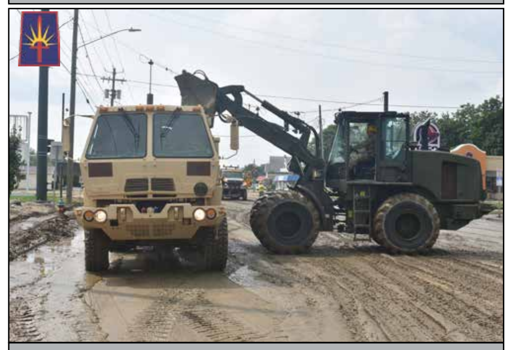
New York Army National Guard Soldiers assigned to the 827th Engineer Company respond to flooding in Binghamton, N.Y., Aug. 15, 2018. Soldiers were responding to flooding throughout many areas of Binghamton assisting civilians and the Department of Transportation.