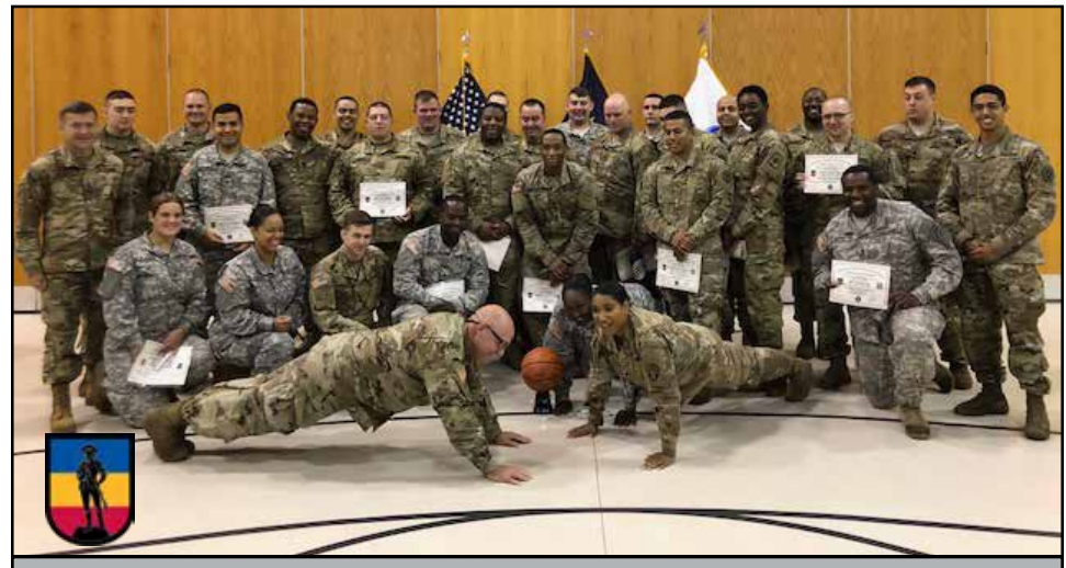
New York Army National Guard Soldiers who participated in the Tactical Athletes Course (TAC), stand together at their graduation ceremony, Aug. 12, 2018. The TAC is a seven-day course that trains Soldiers to be physically and mentally fit.

The other four events will involve equip-