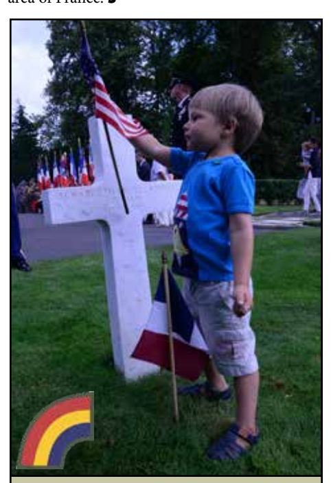
A little boy from France holds an American flag at the Oise- Aisne American Cemetery in Seringes et Nesles, France for a ceremony on July 28, 2018.

areas where the 369th Infantry fought during World War I and laid a wreath at a memorial dedicated to the 369th Infantry during a ceremony at Hartmannswillerkopf, in the Alsace area of France.