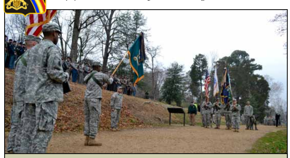
Soldiers from the Sandston-based Battery A, 1st Battalion, 111th Field Artillery Regiment, 116th Brigade Combat Team and the Fredericksburg-based 116th Brigade Special Troops Battalion, 116th Brigade Combat Team participate in the sesquicentennial celebration of the Battle of Fredericksburg Dec. 9. Elements of the New York-based Company A, 1st Battalion, 69th Infantry and the 116th BCT greeted each other on the Sunken Road where they met 150 years ago – then as enemies, today as friends.