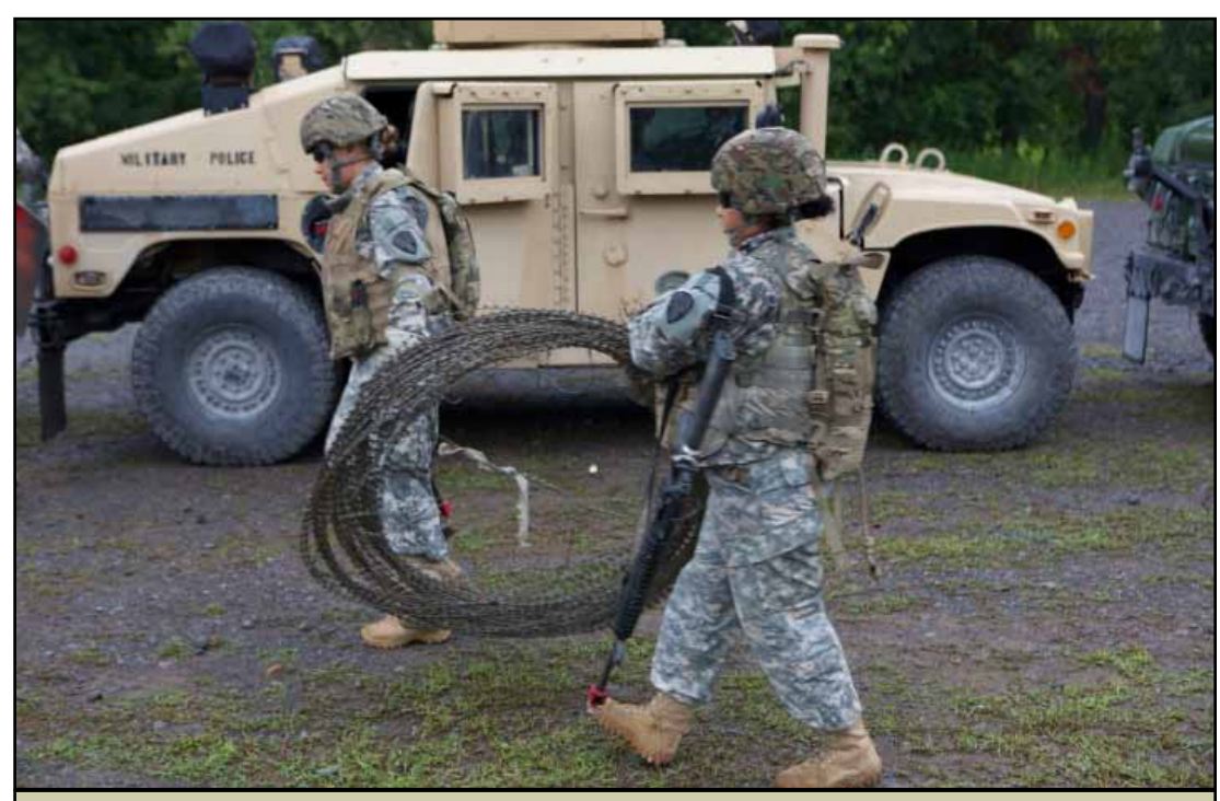
FORT DRUM, N.Y. -Female Soldiers of the 101st Expeditionary Signal Battalion conduct premobilization training Aug. 10th, 2012. The battalion, based in Yonkers, deployed to Afghanistan in Oct. 2012.

There are currently 1,657 women in the New York Army National Guard-- 159 Officers, 23