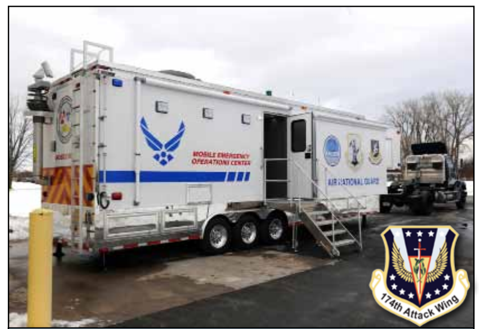
New York State Mobile Emergency Operations Center (MEOC) assigned to the 174th Civil Engineering Squadron. The operations center can be deployed in support of the Federal Emergency Management Agency to assist first responders during disaster response efforts.

The MEOC has up to eight workstations and a conference room. The center has its own weather and Direct TV satellites, providing up to date weather or news information. 9