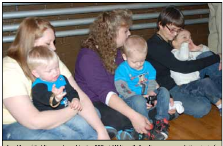
Families of Soldiers assigned to the 222nd Military Police Company await the start of the units deployment ceremony held Feb. 22, at the historic Hornell Armory.

The unit is conducting post-mobilization training at Camp Shelby, MS prior to deploying. gt