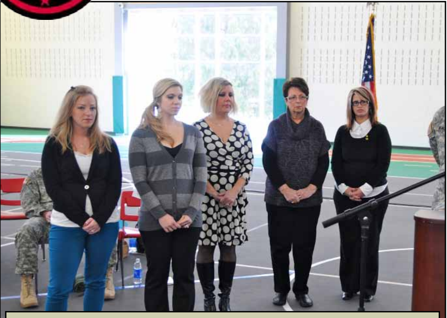
Headquarters and Headquarters Company, 2nd Battalion, 108th Infantry Regiment's Family Readiness Group is recognized during the units Freedom Salute Ceremony held Jan. 12, 2013 at the Mohawk Valley Community College, Utica, N.Y. The unit returned approximately three months ago after deployed in support of Operation Enduring Freedom.