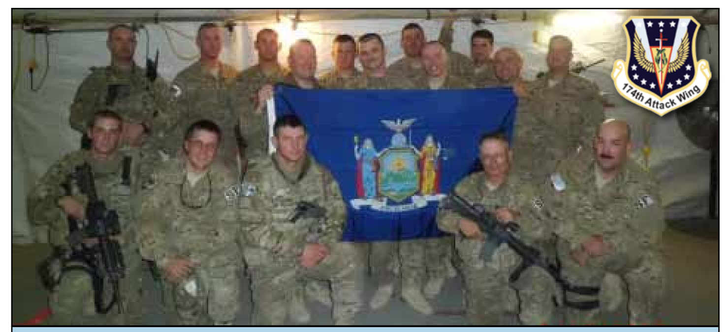
Members of the 174th Attack Wing Security Forces Squadron pose for a group photo while deployed to Bagram Air Base, Afghanistan in late 2012. A total of 30 personnel deployed from Hancock Field Air National Guard Base and provided an array of security functions both inside and outside the wire. This was the fourth overseas deployment for the SFS since 2005.