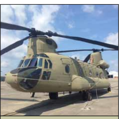
A CH-47F model Chinook helicopter sits on the tarmac in Savannah, Ga. on Oct. 20. This latest model of the battle-tested heavy lift helicopter landed at the Rochester-based Detachment 1, Company B, 3rd Battalion, 126th Aviation facility on Oct. 29, 2014.

Soldiers of Company B also carried priority supplies during the New York National Guard response to Superstorm Sandy in 2012 and to Tropical Storms Lee and Irene in 2011.