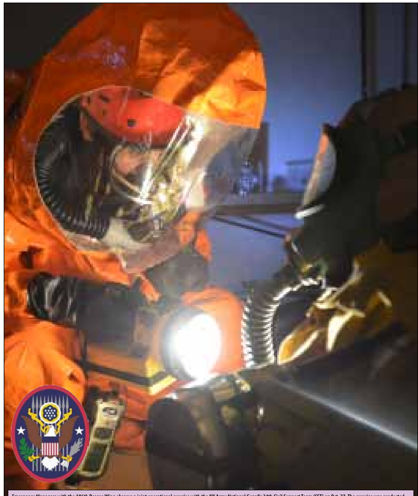
Emergency Managers with the 106th Rescue Wing observe a joint operational exercise with the NY Army National Guard's 24th Civil Support Team (CST) on Oct. 27. The exercise was conducted at the New Highway Pump Station in East Farmingdale, testing existing response protocols to intruder events and identified and correct any existing weaknesses in station security.