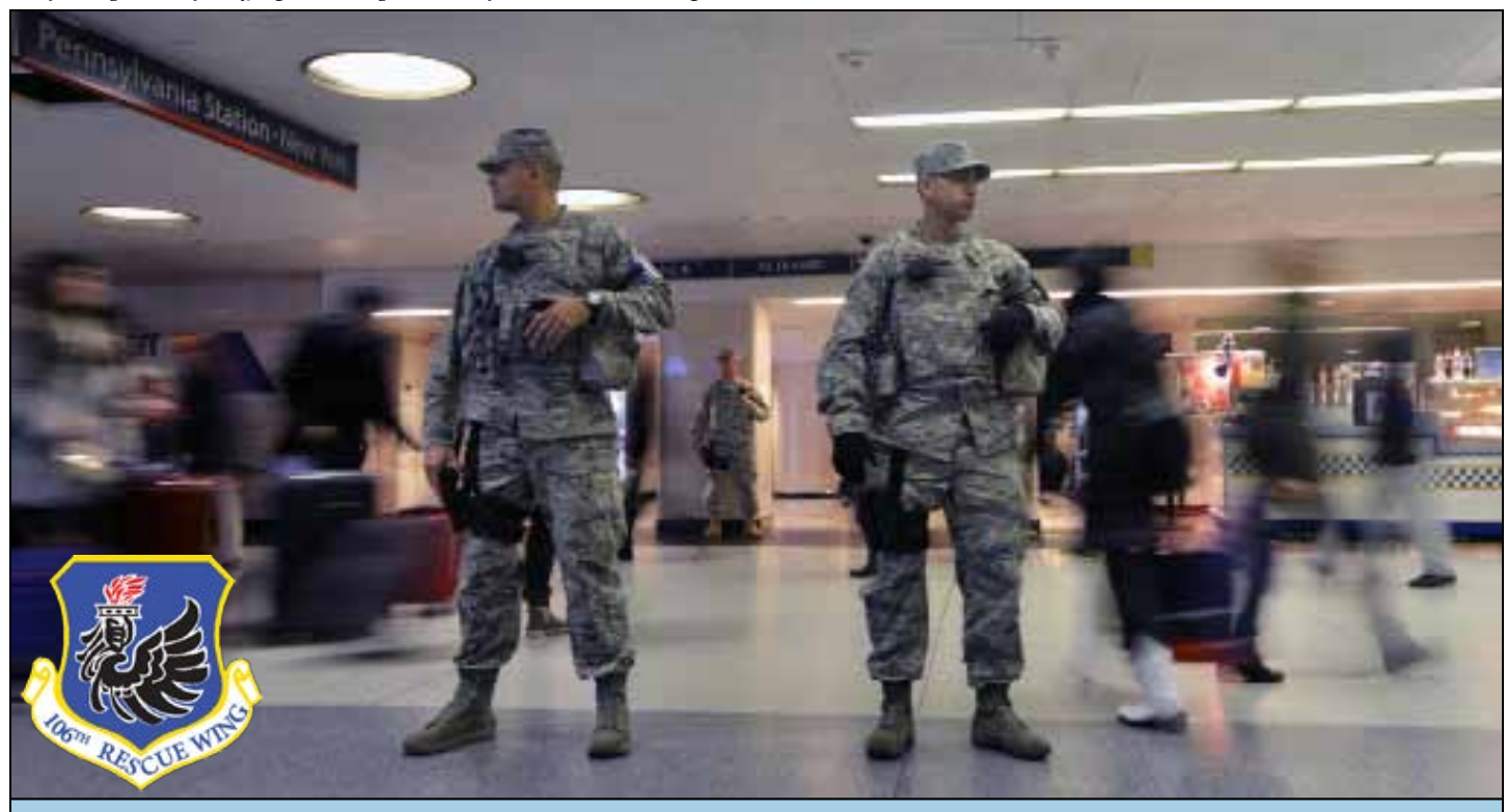
New York Air National Guard Airmen, including over forty from the 106th Rescue Wing, alongside Army National Guard Soldiers, patrol areas around New York City, including JFK Airport, Pennsylvania Station, and the World Trade Center.