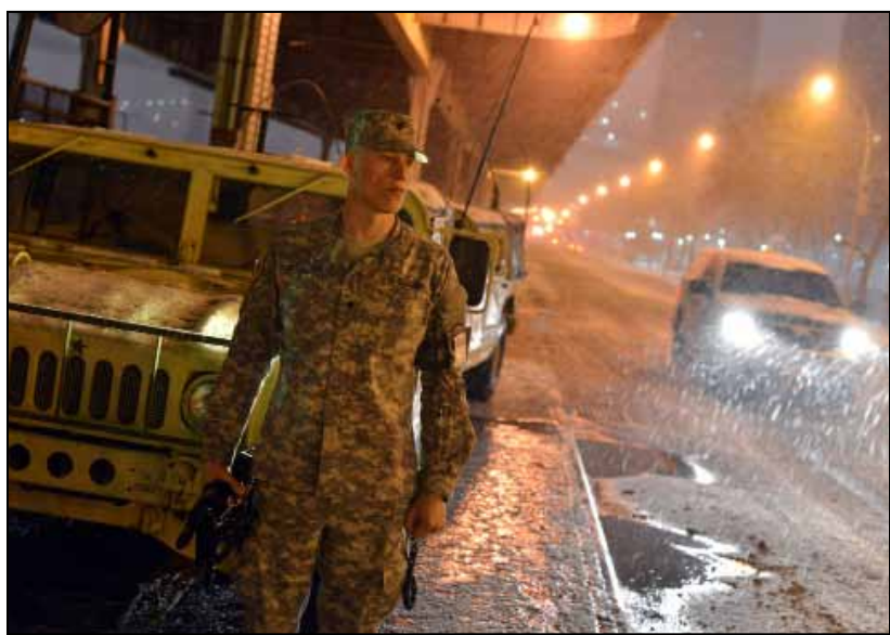
Soldiers with Joint Task Force Empire Shield work with Fire Department-NY Emergency medical technicians during Snowstorm Juno, Jan. 26. The storm, believed to be one of the most powerful in recent history, managed to shut down all New York City airports, subways and other forms of public transit. The Soldiers were on hand to provide support to first responders in case of a major emergency.

NEW YORK- Operation Juno, the New York National Guard response to the snowstorm that struck the northeast from Jan. 26 to 28, involved 446 men and women over four days.