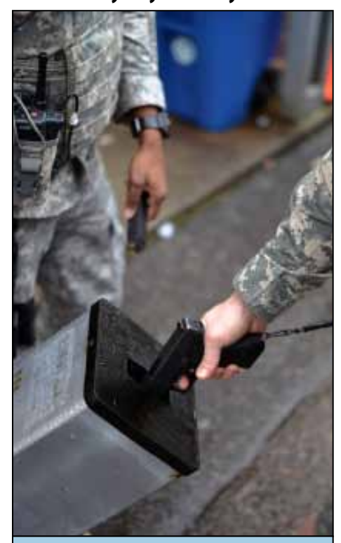
New York National Guard service members with Joint Task Force Empire Shield clear their weapons before leaving for their assigned duty locations throughout the city.

the New York Police Department for counterterrorism support operations since the unit's formation in 2010.