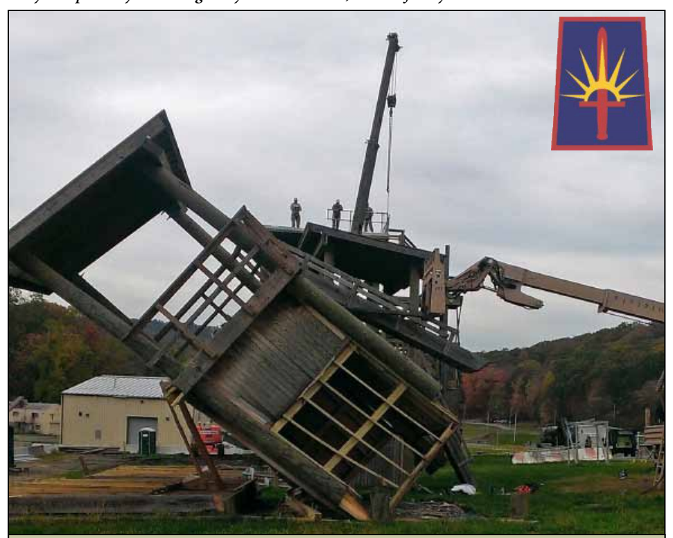
Making way for the construction of a new maintenance facility, New York Army National Guard engineers dismantle one of three rappel towers at the Camp Smith Training Site in late October 2014. The mission was one of several troop-labor projects that the Soldiers accomplished in the first week of their two-week annual training period. The Soldiers, who belong to the 1156th Engineer Company and the 204th Engineer Battalion, also installed better drainage, constructed sidewalks and dismantled an aging set of grandstands, along with other tasks.