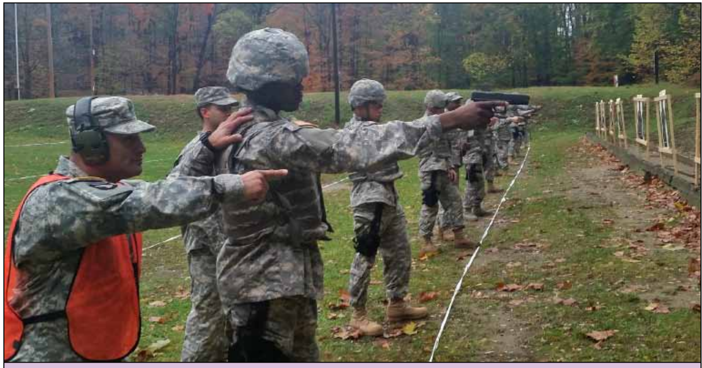
A rotation of New York's Joint Task Force-Empire Shield Soldiers fire at Camp Smith's 9mm pistol range on October 23, 2014. The Soldiers practice their shooting skills quarterly with police-style Glocks rather than the Army issued M-9.