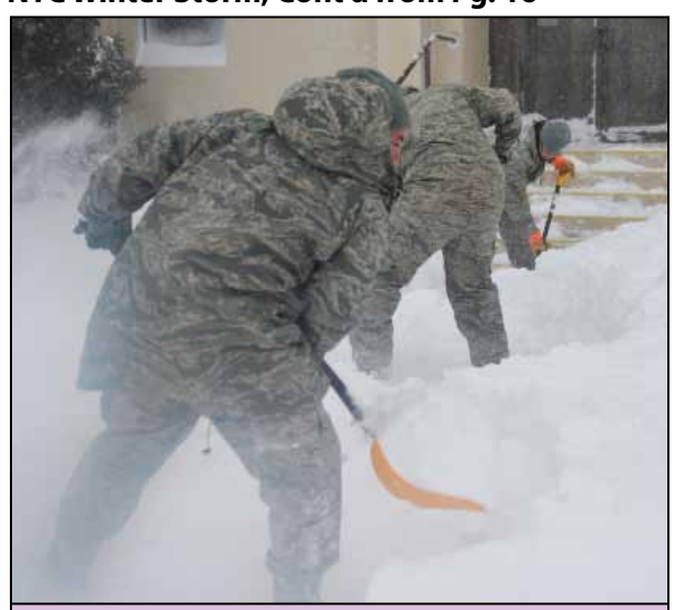
Members of the New York Air National Guard's 106th Rescue Wing dig their way into the office at F.S. Gabreski Air National Guard Base here after Winter Storm Juno January 27th.

on Long Island to assist in moving state emergency supplies if requested.