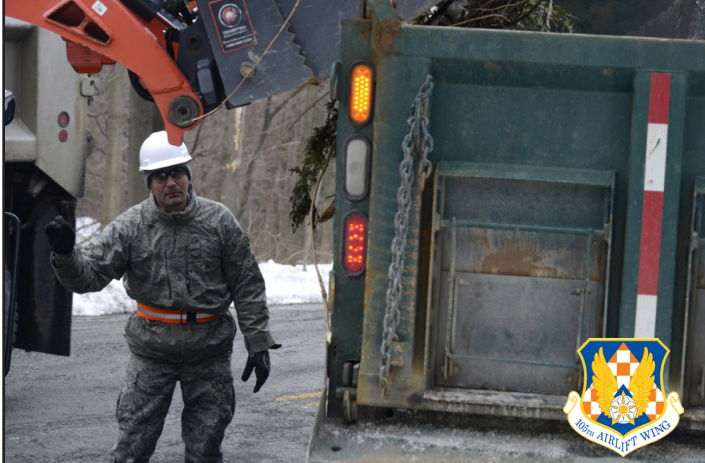
Twenty Airmen assigned to the 105th Airlift Wing deployed to Putnam County, New York, in early March to help town and county workers clear debris from roadways. The county was hit hard with a winter storm knocking down trees and causing widespread power outages.