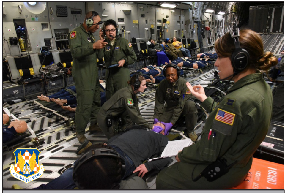
Airmen from multiple aeromedical evacuation squadrons treat a patient during a mock emergency scenario en route to Jackson, Mississippi, Feb 15, 2018. Airmen from multiple squadrons formed teams to coordinate and work together for the PATRIOT South 2018 exercise.

FCCs are divided into regions composed of multiple states. The centers have Patient Receptions Areas staffed with nurses, doctors, litter bearers, transportation teams, joint patient tracking teams, and additional medical team members for oversight.