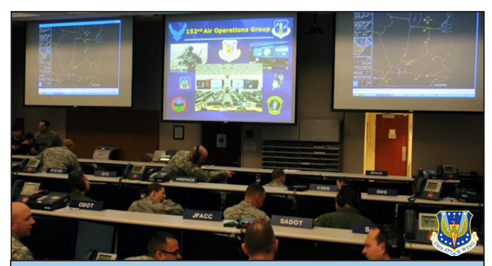
Airmen of the 152nd Air Operations Group man work stations during Virtual Flag, a computer wargame held Feb. 18-26 from Hancock Field Air National Guard Base in Syracuse. The computer hookup allowed the air planners of the 152nd to interact with other Air Force units around the country and in Europe.