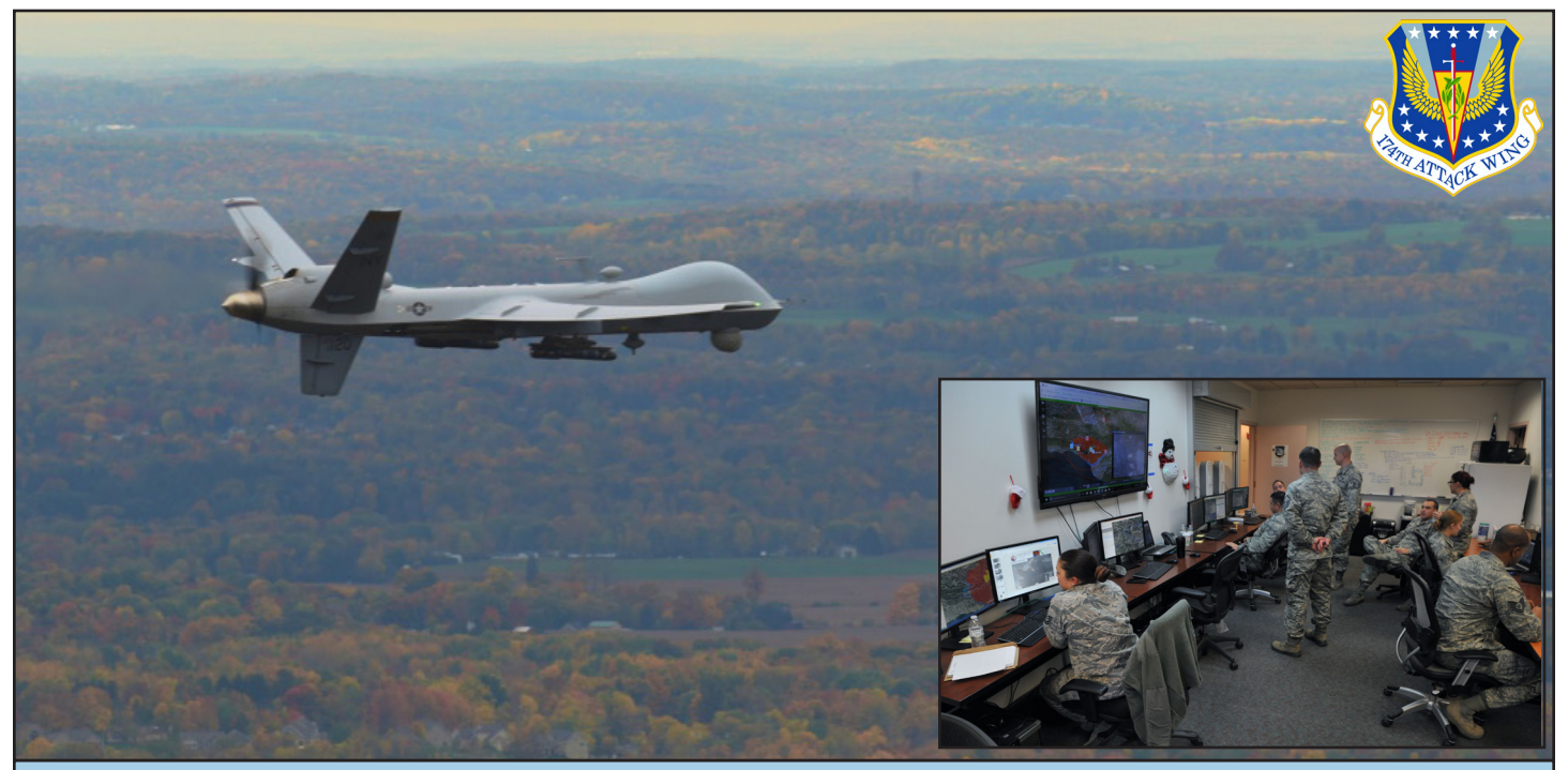
A remotely piloted MQ-9 Reaper operated by the New York Air National Guard's 174th Attack Wing flies a routine training mission over Central New York on October 23, 2016. Inset photo: California Air National Guardsmen of the 195th Intelligence, Surveillance, and Reconnaissance Group analyze full-motion video of the Thomas Fire at Beale Air Force Base, Calif., and relay their findings to fire crews on the ground, Dec. 11, 2017. The team is using imagery from the MQ-9 Reaper to map the fire lines and look at fire expansion and progression.

SYRACUSE, N.Y.-- Nine members of the 174th Attack Wing were dispatched to California December 13, 2017 to assist the California Air National Guard's 163rd Attack Wing in flying MQ-9 remotely piloted aircraft which have been assisting local authorities in fighting the massive Thomas Fire.