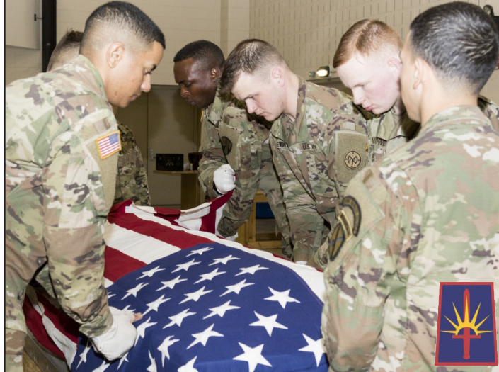
New York Army National Guard Soldiers practice carrying drills during in the 40-hour Level One Honor Guard Training Course at Camp Smith Training Site, Cortlandt Manor, N.Y., Mar. 1, 2018. This physically demanding course is designed to train and test Soldiers' abilities at the nine unique positions of the modified military funeral honors detail.