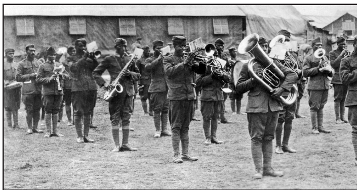
At top, Soldiers of the 369th Infantry Regiment man a trench in France during World War I. Above, members of the 369th Regimental Band perform in France. Courtesy photos.

new regimental number as the now-renamed 369th Infantry Regiment. Not that it mattered much to the Soldiers; they still carried their nickname from New York, the Black Rattlers, and carried their regimental flag of the 15th New York Infantry everywhere they went in France.