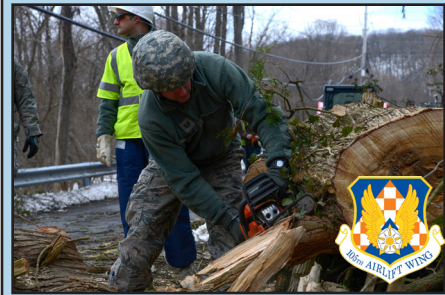
An Airmen from the 105th Airlift Wing clears debris from a road in the town of Carmel, N.Y. on March 5.

"We are backfilling the need for extra manpower because of the amount of trees that came down and are blocking roadways and stopping power lines from being repaired," Galioto said.