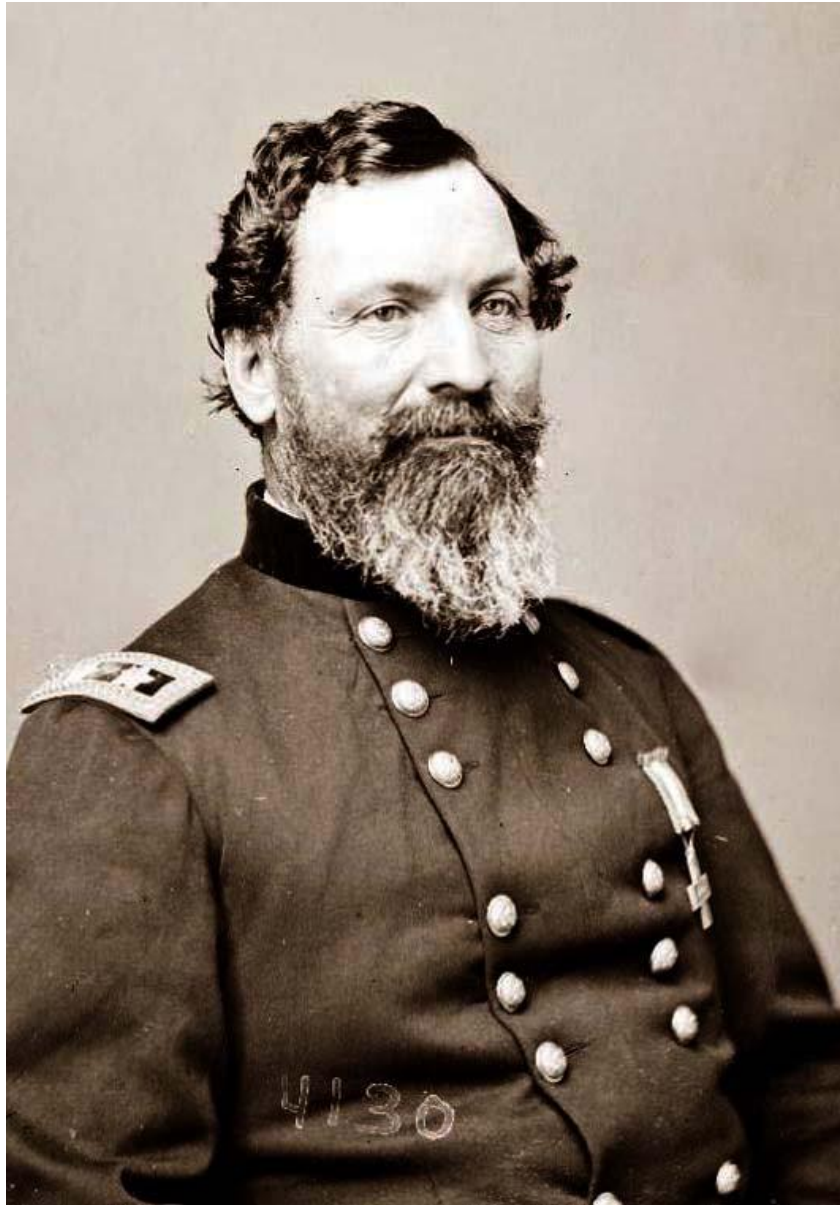
General John Sedgwick

Warm + Gusty. Parked all day near Spottsylvania Church. Heavy firing towards the evening. Gen'l Sedgwick killed.