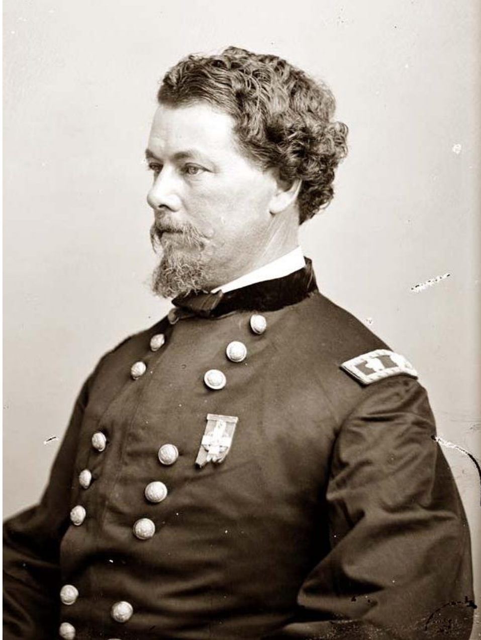
General Horatio G. Wright Commander of "Bloody Sixth Corps"