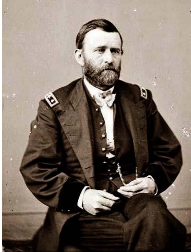
General U.S. Grant