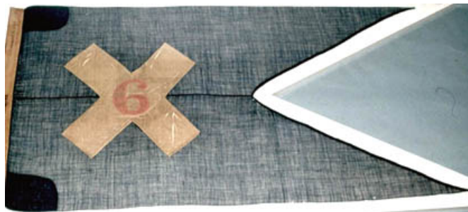
The Headquarters Flag of the Sixth Army Corps