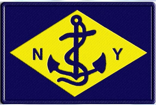
The diamond patch to cover the ACE.

If you are still in the U.S.N., this modification is not appropriate.