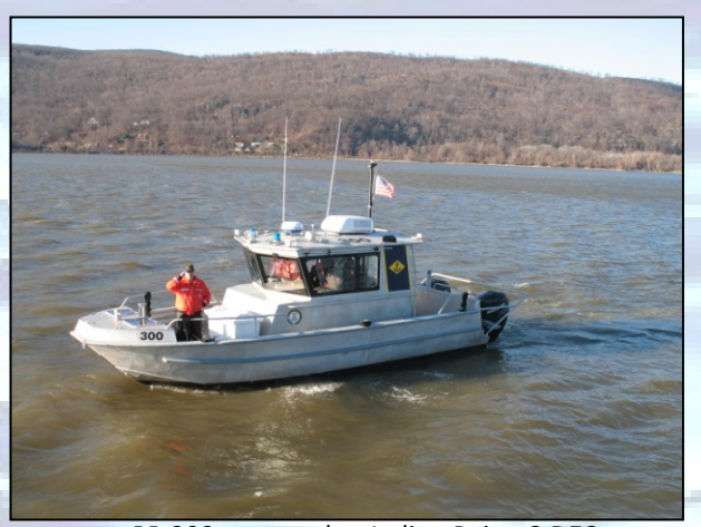
PB 300 on patrol at Indian Point, 8 DEC