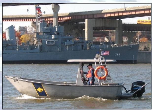
PB 221 conducts training at Albany, 9 NOV