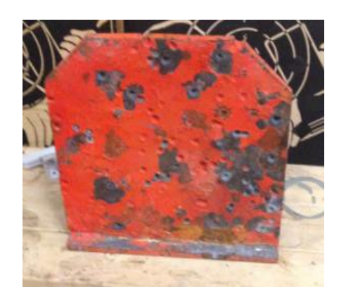
FIG 28 Pistol Target

Base Width: 12" Top Width: 8" Height: 12"