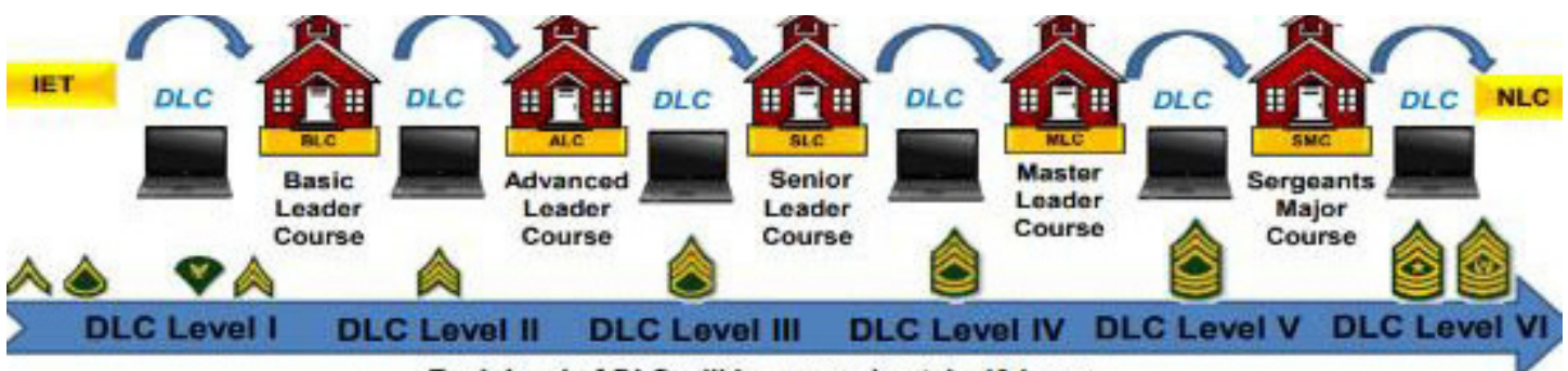
Each level of DLC will be approximately 40 hours

Be safe, and I'll see you on the objective!