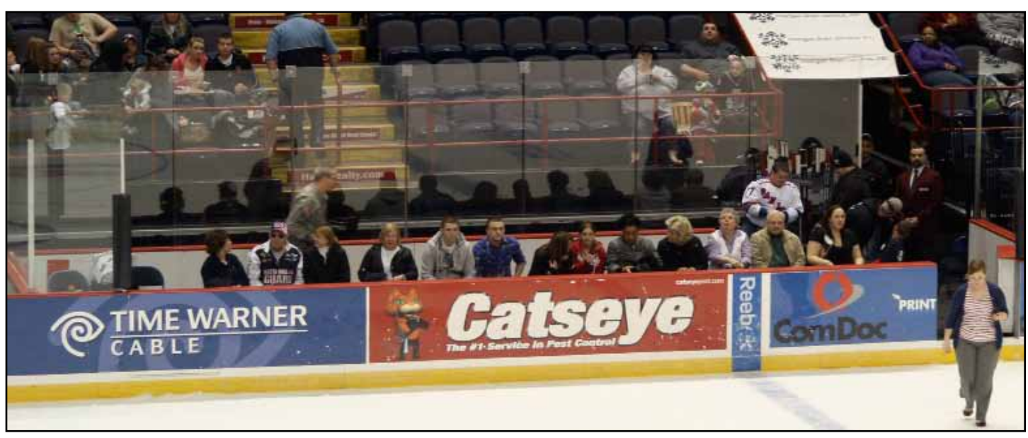
ALBANY N.Y.-- Families of the new York Army National Guard's (NYARNG) 501st Ordnance Battalion Soldiers watch and wait for their chance to see and talk with their Soldiers currently deployed in support of Operation New Dawn at the Times Union Center during an Albany Devils hockey game April 3.

"We want to do more, and plan to do more next year," he explained.