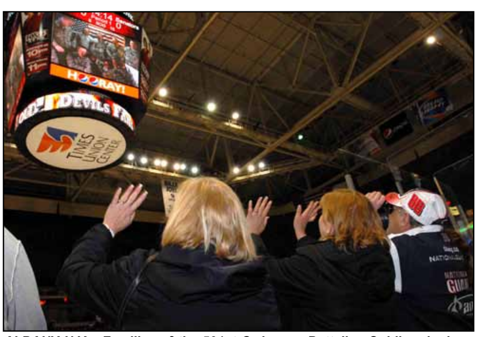
ALBANY N.Y.-- Families of the 501st Ordnance Battalion Soldiers look up and wave as the Soldiers appear on the Times Union Center's jumbotron during an Albany Devils hockey game April 3.