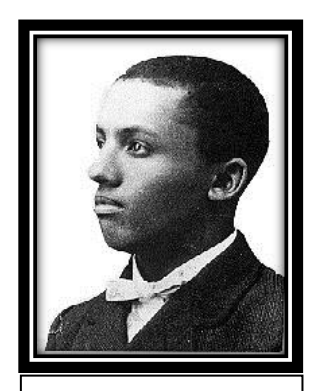
Carter G. Woodson

The theme for 2017 focuses on the crucial role of education in the history of African Americans. Association for the Study of African American Life and History's (ASALH's) founder Carter G. Woodson once wrote that "if you teach the Negro that he has accomplished as much good as any other race he will aspire to equality and justice without regard to race." Woodson understood well the implications associated with the denial of access to knowledge, and he called attention to the crisis that resulted from persistently imposed racial barriers to equal education. The crisis in black education first began in the days of slavery when it was unlawful for slaves to learn to read and write . In pre-Civil War northern cities, free blacks were forced as children to walk long distances past white schools on their way to the one school relegated solely to them. Whether by laws, policies, or practices, racially separated schools remained the norm in America from the late nineteenth century well into our own time.