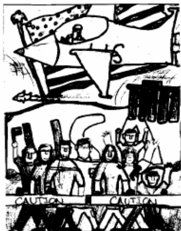
2008 1st Place Army Troy Clark – 6 th Grade