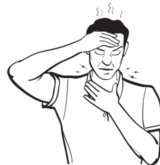
Sore throat with fever