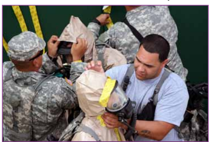
CBRN enterprise troops prepare their team members for duties on the decontamination line during the disaster-response exercise.

• The 104th Military Police Battalion Headquarters based in Kingston, N.Y., who provide command of the CBRN response elements at