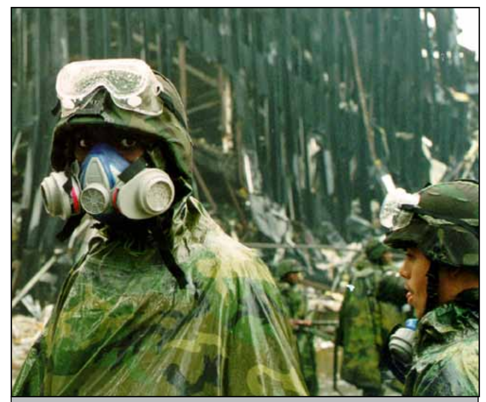
A New York Army National Guard Soldier from Co. C, 1st Bn., 105th Infantry helps provide security at Ground Zero Sep. 14, 2001 as part of the Guard response to 9/11.

Troops assisted with initial rescue efforts, security for first responders and law enforcement and provided additional expertise for logistics, security administration and recovery support. It was the single largest response mission