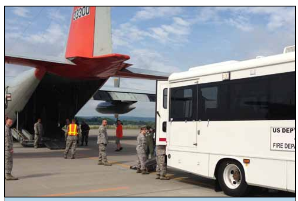
Civilian agencies, such as the Department of Veterans Affairs, partnered with airmen from the 109th Airlift Wing during the exercise, which was designed to practice patient movement, treatment, and distribution to local hospitals for treatment.

Stratton Air National Guard Base acts as a federal coordinating center to recruit hospitals and maintain local non-federal hospital participation in the NDMS; coordinate exercise development and emergency plans with participating hospitals and other local authorities in order to develop patient reception, transportation, and communication plans; and during system activation, coordinate the reception and distribution of patients being evacuated to the area.