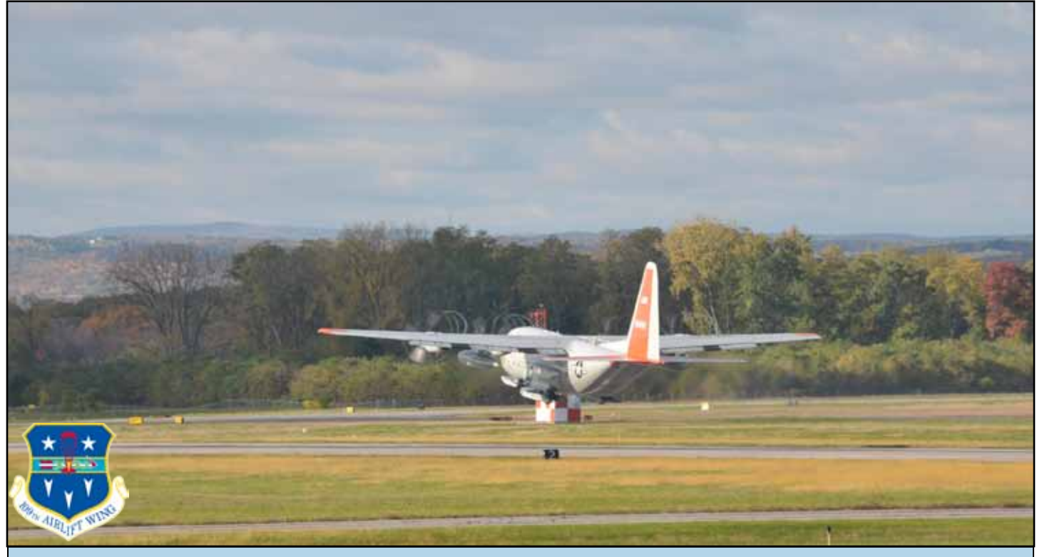
An LC-130 aircraft, bound for Antarctica in support of Operation Deep Freeze, takes off from Stratton Air National Guard Base Oct. 18.

In 2008, another 109th LC-130 rescued an Australian researcher who had broken his leg in an accident and flew him to Hobart, Australia from Antarctica. gt .