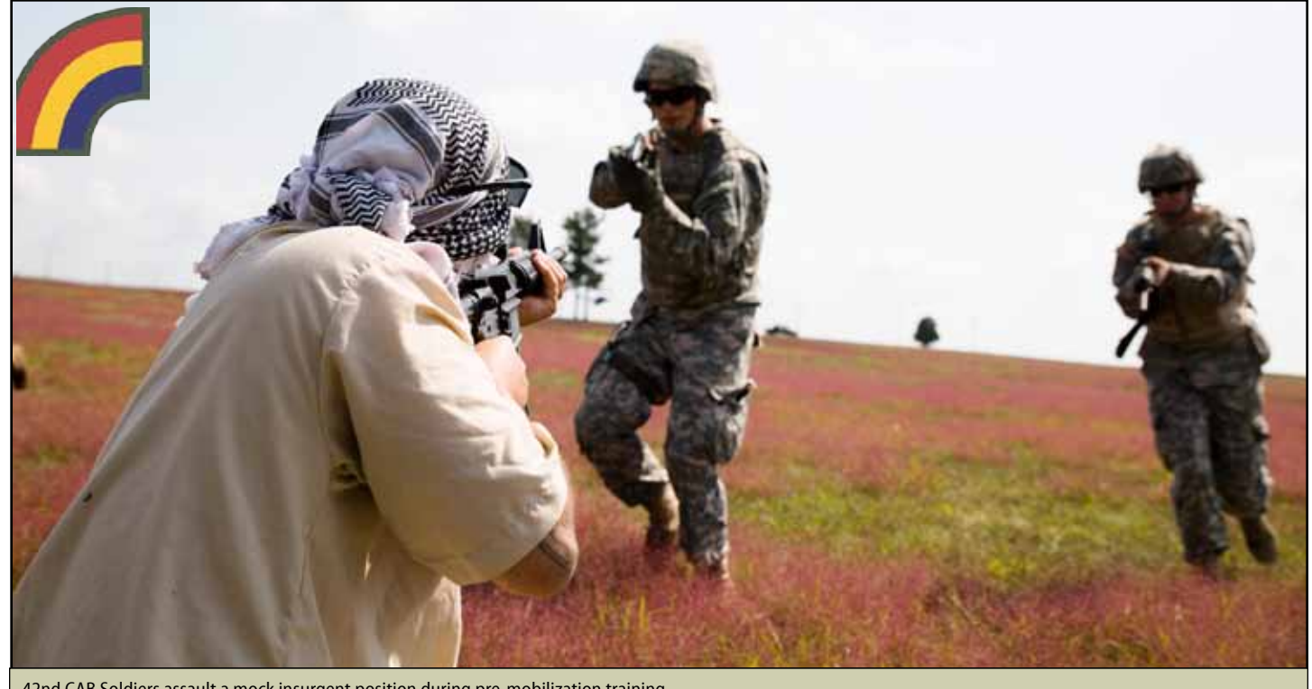
42nd CAB Soldiers assault a mock insurgent position during pre-mobilization training.

"Stay hydrated," he said with a smile. "Stay active. Don't get bored, you'll get in trouble. 9t