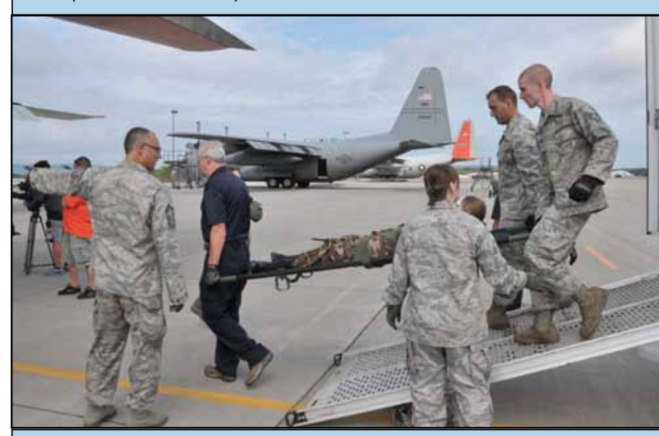
Airman of the 139th Aeromedical Evacuation Squadron, 109th Airlift Wing work alongside civilian agencies to carry a simulated patient, to an LC-130 aircraft during the exercise.

The airmen of the 109th AW have responded to a number of state emergencies, including Tropical Storm Irene in 2011 and Superstorm Sandy in 2012. In addition to supporting the