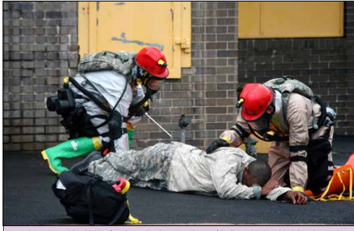
New York Army National Guard Soldiers from the search and extraction element of the Chemical, Biological, Radiological and Nuclear (CBRN) enterprise evaluate a simulated casualty during a disaster-response exercise at the Westchester County Fire Training Center, Valhalla in August.

The HRF consists of troops with expertise in the search and extraction of disaster victims, incident site security, decontamination, medical