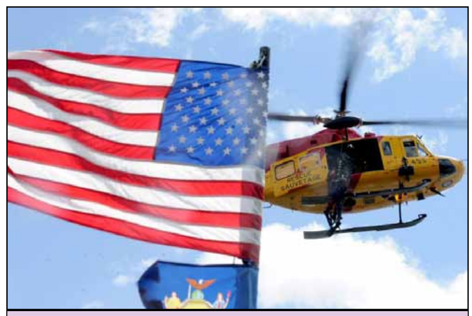
Royal Canadian Air Force Search-and-Rescue technicians are hoisted back aboard a CH-146 Griffon helicopter during a joint-training exercise hosted by the New York Air National Guard's 174th Attack Wing in August.

"The addition of the Canadian forces was a unique opportunity to further blend otherwise disparate units into a single mission-cohesive force," Cox said. "We have proven that the MQ-9 is an enormously valuable tool in support of maritime forces. Training like this demonstrates the evolving and indispensable role of Air Force JTACs and remotely-piloted aircraft across a broad spectrum of joint operations, from tactical operations to civil support operations."