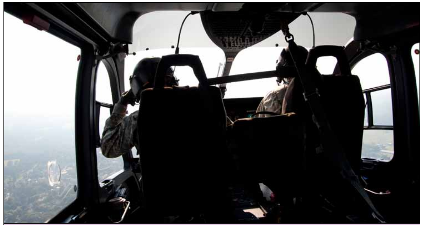
Counterdrug aviation Soldiers fly a UH-72A Lakota on a search for marijuana plants. A Rensselaer County law enforcement agent is also on board. If found, the marijuana is either marked for eradication at a later time, or ground support is called in to destroy it.

"They really appreciate us coming out to aid in their role to keep their counties clean," said the pilot. "We're helping them keep drugs off the street and out of schools, and they love when we are able to come out. It's a very good relationship." gt