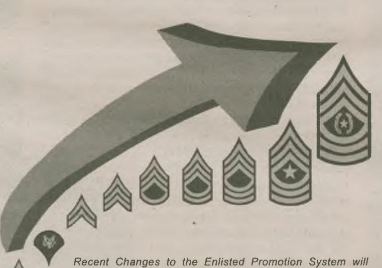
Recent Changes to the Enlisted Promotion System will decentralize the process out to the units in the field to provide a faster response time to soldiers.

From the promotion list, a Priority of Training List or PTL is developed. The PTL lists the top 10% of soldiers in each MOS, by grade who require NCOES for promotion. The PTL is mailed to each battalion along with the promotion list.