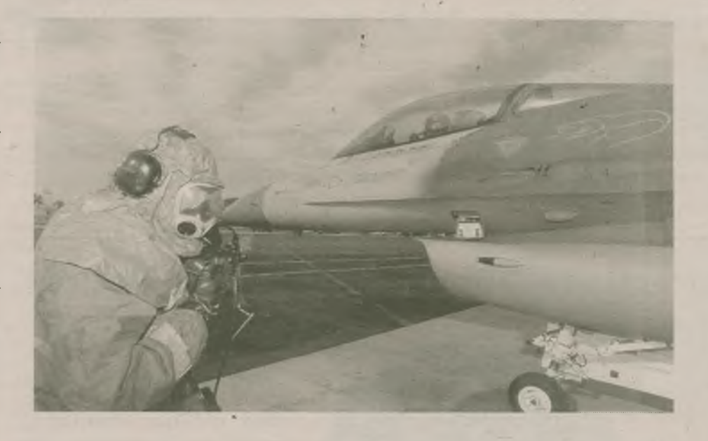
Crews from the 174th Fighter Wing conduct Nuclear, Biological, and Chemical (NBC) warfare training during the Fighter Wing's last Operational Readiness Inspection. The 174th conducted this year's inspection during the unit's recent deployment as part of Operation Northern Watch in Southwest Asia. The deployment is part of the Wing's support of the Aerospace Expeditionary Force Five.

In conjunction with the AEF deployment, the 174th underwent an 11-day Operational Readiness Inspection. This is the first time an Air National Guard unit received an ORI while deploying on a real-world combat mission. ORIs are performed on all Air Force units on an average of every four