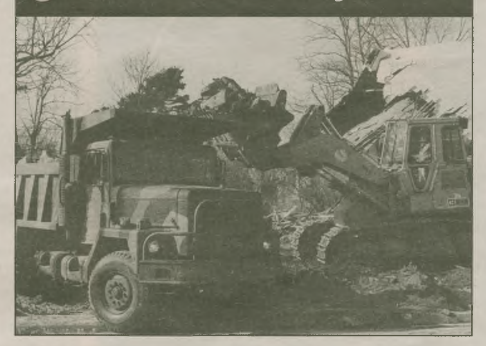
A 5-ton Dump Truck of the 204th Engineer Battalion is filled with demolition debris by a civilian contractor working for the Long Island community of Bayshore. The New York National Guard Counterdrug Program in conjunction with the 204th is helping the community get rid of abandoned buildings that drug dealers had been using. New low-income housing construction is planned once the old buildings are gone. Look for the story in the March -April issue of Guard Times.