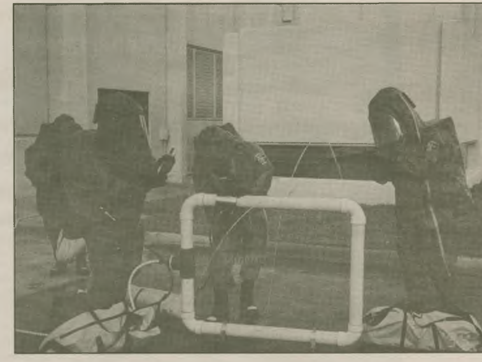
RAID team members in special protective suits conduct a training exercise at an Army school in the SouthEast.

The RAID members come from across the military spectrum – Army, Air, Navy and Marine Corps – and from active duty and reserve assignments. Many signed on with the New York unit after performing related duties in overseas assignments. Some have earned advanced degrees; virtually all are certified in areas from HazMat practices to the latest communications techniques. Their specialties range from Nuclear Medicine to Computer Science and beyond.