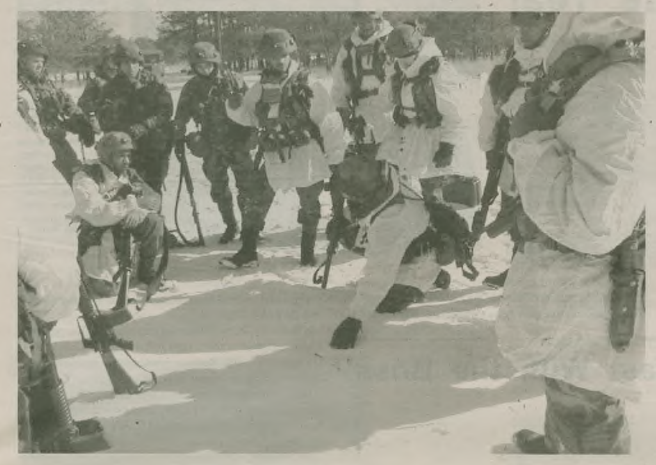
Second Platoon Non-Commissioned Officer leaders conduct final brief-backs before launching their attack against CLF guerillas. The guerillas, drawn from the ranks of ROTC cadets from Drexel University, established ambush sites for one of Charlie Company's, rifle platoons. The cadets participated in the 105<sup>th</sup> Infantry training exercise to prepare for a Joint Readiness Training Center deployment next year.

also saw the Guardsmen conduct the night attack on the abandoned village defended by the Drexel cadets described above.