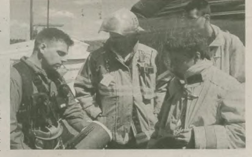
A CSD decontamination team member reviews unit equipment for firefighting personnel at April's training exercise. The event was the team's first opportunity to train with local first responders.