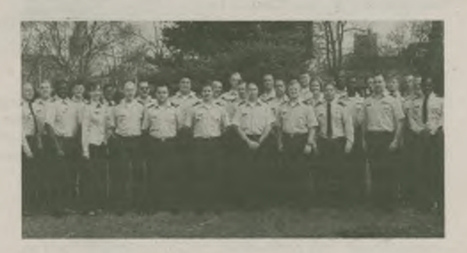
Members of the Company Commander's Course pause for a group photo. The course provided a foundation for future leaders on personnel, training, logistics, family support, employer support, and recruiting and retention issues. The drill in Glens Falls included members from all commands in the state.