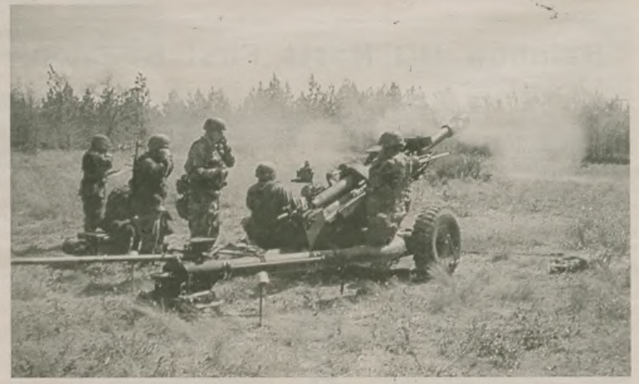
Members of Battery C, 1st Battalion, 156th Field Artillery took a break from the Rochester winter this March when the battery seized an opportunity to conduct deployment training via C5 Galaxy to Camp Blanding, Florida. The unit went through the mobilization exercise and conducted vehicle and equipment airload rigging and inspections before heading South for a live-fire exercise. The training focused on many of the unit's field skills in anticipation of the 27th Enhanced Separate Infantry Brigade's upcoming Annual Training and Joint Readiness Training Center rotation in 2001.