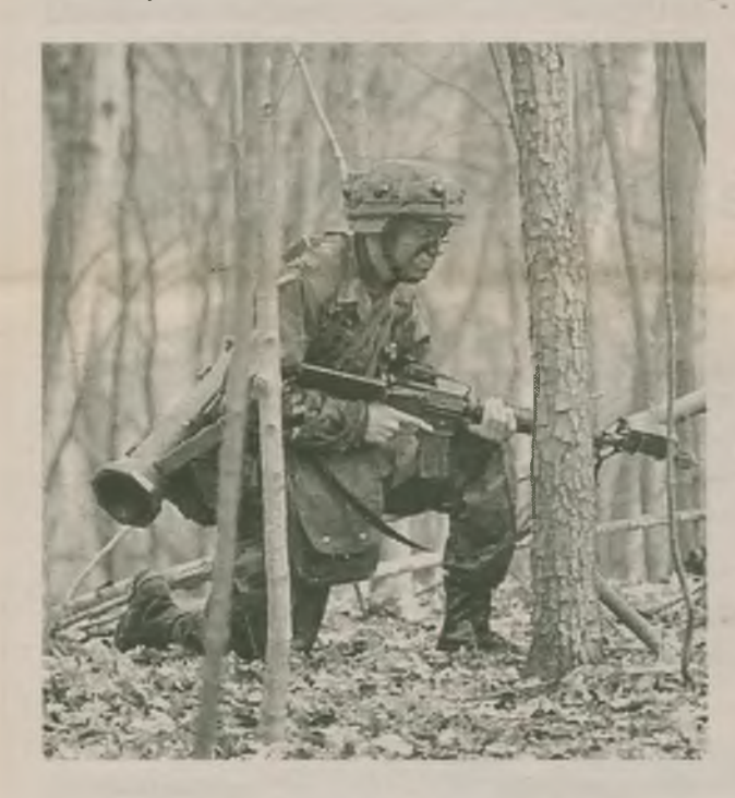
A Siena College Army ROTC Cadet armed with a "Viper antitank rocket takes cover from sniper fire. Two dozen Army National Guard soldiers from several Troy-based units provieded aggressor support against the Mohawk Battalion during a field training exercise March 25, 2000.

The New York Army National Guard was invited to play "OPFOR", or Opposing Forces, against the ROTC cadets. Over twenty volunteers — from Bravo and Charlie Companies, 1-101 Armor, the 642d Military Intelligence Battalion and HHC, 42d Infantry Division donned MILES gear and the distinctive green wool OPFOR shirts of the "Voohreeian Liberation Army."