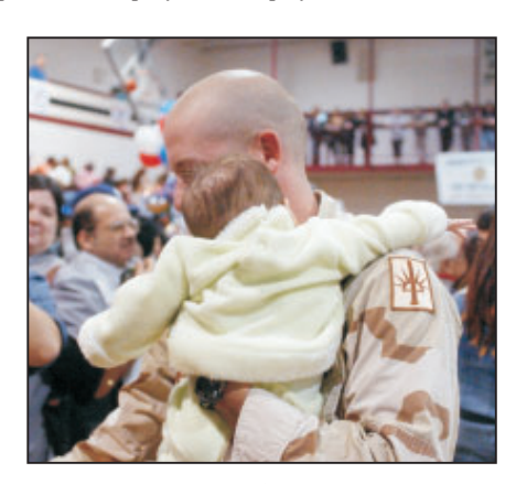
A Soldier's reward. A 442^{\rm nd} MP is back with his family.

Delivering supplies on the roads of Iraq and Kuwait were the soldiers of the New York Army National Guard's 719th Transportation Company and 427th Forward Support Battalion. About 40 members of the 427th Forward Support Battalion were mobilized and merged with the 719th Transportation Company for the deployment.