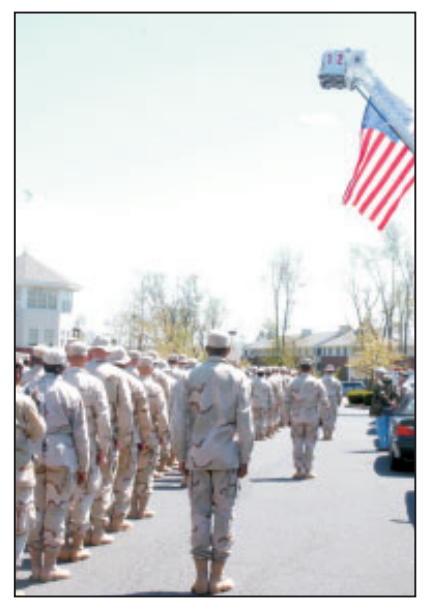
The 442<sup>nd</sup> MP's march down the avenue in front of Dominican College prior to being released from Active Duty.