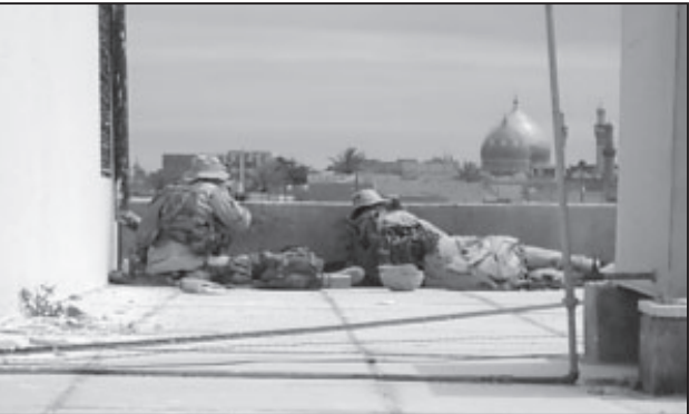
Perched over the top of a building are two soldiers from the 105th Military Police Company cautiously scanning over the city of Bagram.

While none were anxious to go back to Iraq, they all knew that their comrades were awaiting their return so they too, could take time off. For the Soldiers and