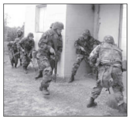
Soldiers from the 127th Armor prepare to clear a building during MOUT training at Fort Drum, NY.

fourth lane tasked the medics and engineers. Soldiers conducted patrols through a village and discover they have moved into a minefield, which produced casualties. They performed first aid on the casualties and extract themselves from the minefield. The fifth lane concentrated on military checkpoint operations. Situations that