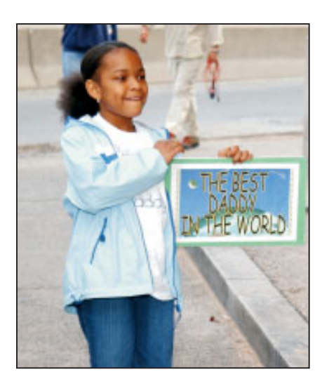
Happy to have him home. A Soldier's daughter awaits the 719th's release from Active Duty.

Nearly 90 Soldiers dressed in Desert Camouflage Uniforms (DCU's) returned from Fort Dix, N.J. after completing demobilization requirements. In order to fulfill their mission requirements, approximately 50 Soldiers from the 427^{\text{th}} Support Battalion from Rochester, Syracuse and other upstate locations were also deployed as members of the 719^{\text{th}} .