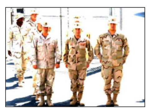
A small contingent of about 20 Capital District Soldiers from the 105th MP's form up after their bus rolled into the Schenectady armory. They were released from Active Duty shortly after this photo. The bus was escorted by seven local police vehicles.