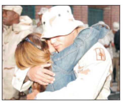
A 719th Soldier embraces his wife.

"We knew all of the time, the strong support we had."