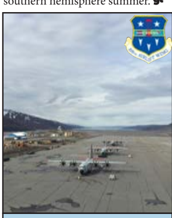
Ski-equipped LC-130 aircraft from the 109th Airlift Wing sit on the runway at Kangerlussuaq, Greenland on June 5, 2018.

The Greenland season for the 109th will wind down in August, with only a brief respite before the focus shifts to Antarctica for the southern hemisphere summer.