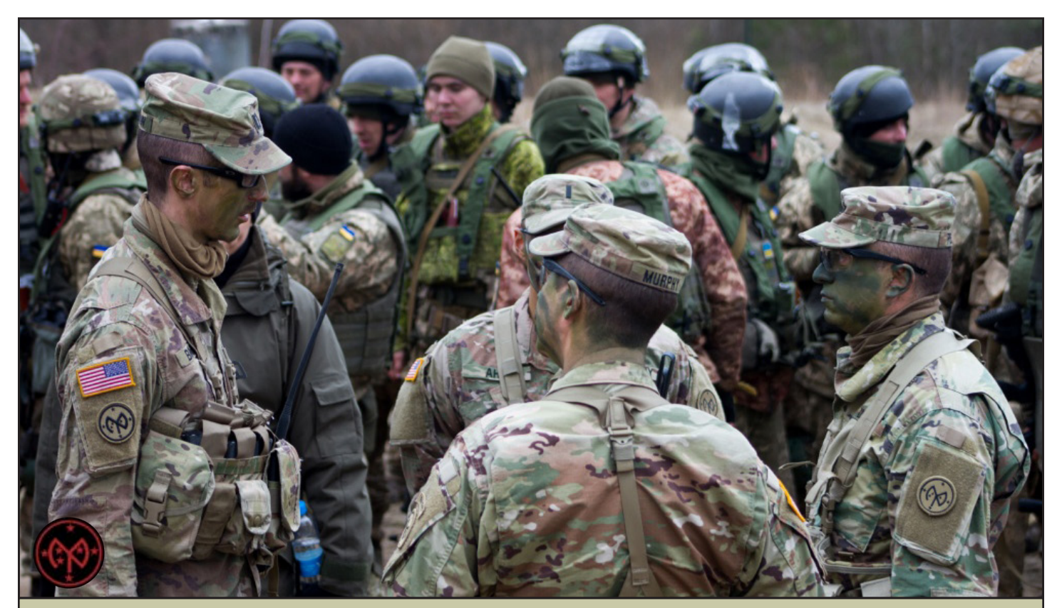
Top, Soldiers from the 27th Infantry Brigade Combat Team assigned to the Joint Multinational Training Group – Ukraine prepare for a battalion field training exercise at the Yavoriv Combat Training Center March 15. Bottom left, soldiers assigned to the Ukrainan 3rd Battalion, 14th Mechanized Brigade fire an RPG-7 rocket-propelled grenade during training on Jan. 30, 2018. Bottom right, More than 220 New York Soldiers are deployed to Ukraine where they are working hand in hand with the Ukrainian Army as they strive toward their goal of achieving NATO interoperability.