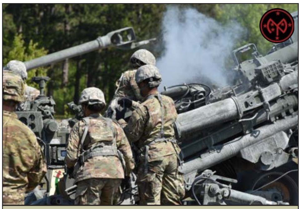
Soldiers from Charlie Battery, 1st Battalion, 258th Field Artillery, clear a M777 Howitzer, on Fort Drum, N.Y., May 22nd, 2018. The 258 was conducting annual training for their new M777 Howitzer. Soldiers spent two weeks preparing to fire the weapons, which are more powerful than the previous canon's used.