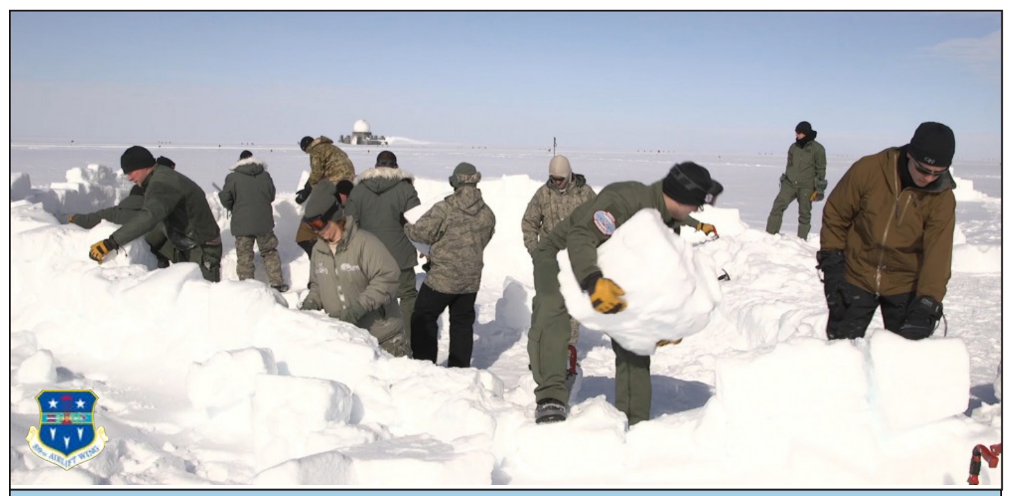
Students build a shelter during barren land arctic survival training, commonly known as "Kool School" on June 9, 2018 at Raven Camp, Greenland. This year, 25 Airmen from the New York Air National Guard's 109th Airlift Wing in Scotia, New York, completed the training, learning basic arctic survival skills.