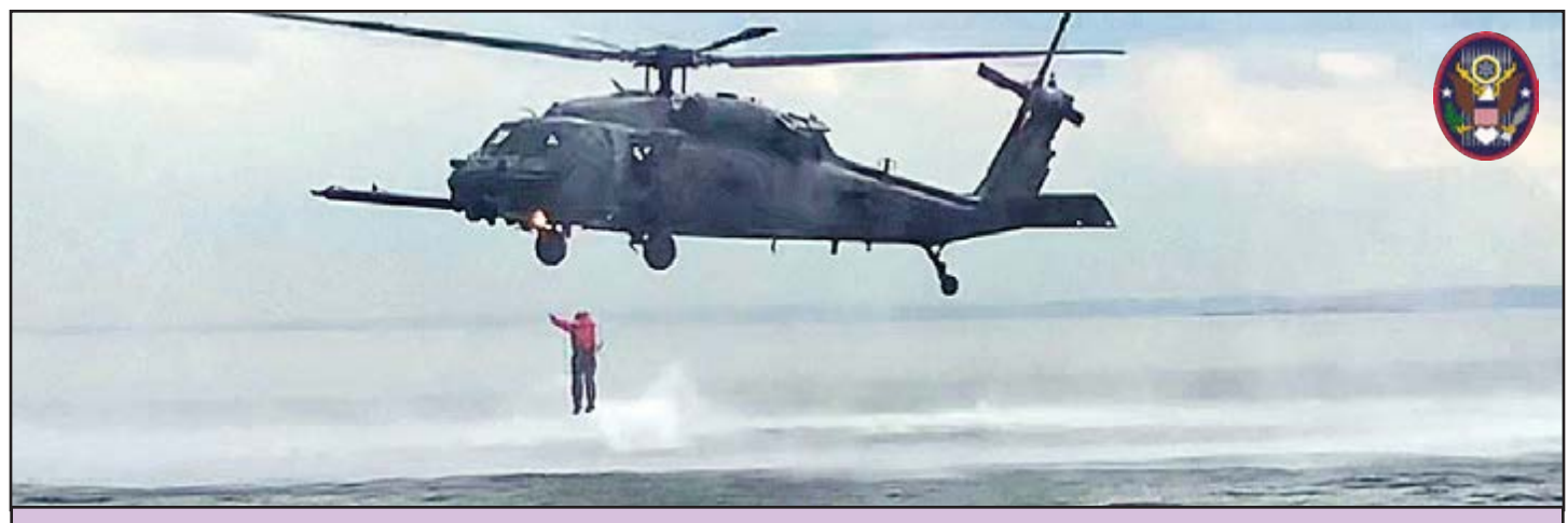
A member of the 24th Civil Support Team exits a hovering HH-60 Pave Hawk helicopter during helocasting off Fort Hamilton, Brooklyn in Gravesends Bay on June 6, 2018. The team, which specializes in identifying chemical, biological and radiological agents, trains on deploying into water in case they need that method to get to a target location in New York City.