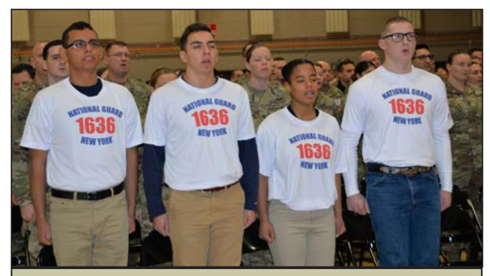
New York Army National Guard Soldiers stand at attention during the celebration of the 381st birthday of the National Guard at the Joint Force Headquarters in Latham, N.Y., December 13, 2017. The New York National Guard now has a smartphone app to help with recruiting, retention and incentive questions from Soldiers.

The app lists the top ten military occupations offering bonuses that range across the combat,