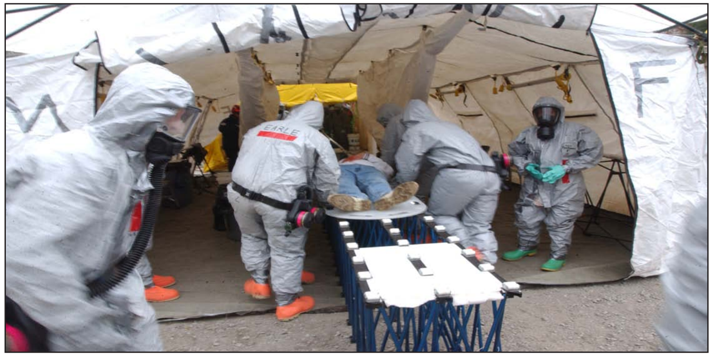
Joint members of New York National Guards' Chemical, Biological, Radiological, Nuclear or High Yield Explosive Enhanced Response Force Package (CERF-P) team prepare to move a casualty into a decontamination tent, where the individual will be washed to remove chemical agents Nov. 3, 2007.