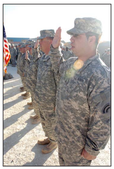
Twelve 42nd Infantry Division's Special Troops Battalion Soldiers take their re-enlistment oath Nov. 12 at Cairo West Airbase, Egypt during Operation Bright Star 2007.

STEWART AIR NATIONAL GUARD BASE, NEWBURGH - Airmen of the 105th Logistics Readiness Squadron's Aerial Port and 137th Airlift Squadron Loadmasters load Pre-positioned Equipment (PEP) onto a C-5A Galaxy. The 105th Airlift Wing in conjunction with the Department of Homeland Security and the Federal Emergency Management Administration, Region II conducted a deployment exercise loading a C-5A Galaxy with FEMA's deployable PEP, which is used for protection, detection, decontamination, communications, and explosive ordnance disposal. The equipment is used in multiple environments and is specifically tailored to sustain and reconstitute local and state first responders sufficient for 72 hours of response and recovery. This is the first time this equipment has ever been loaded onto an airframe.