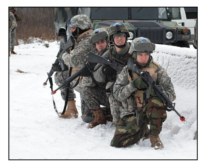
Soldiers of Troop B, 2nd Squadron 101st Cavalry wait in a four-man stack for the right moment to clear a room during urban combat training at Fort Drum.

We haven't reached our peak yet, but we will." gt