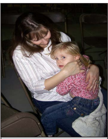
A mother and daughter prepare to depart the 27th Brigade Combat Team's send-off ceremony after the conclusion of the event.

We live in a stress filled world and as military personnel our lives are more complicated and busy than most. Current mission levels for our organizations in New York State have Soldiers and Airmen giving 100%,...all they have. Our training and experience has shown the world that we have a deeply committed and professional force that is second to none. Continuing to carry this responsibility without detrimental consequences to ourselves or our loved ones means that we must rest well and rejuvenate ourselves.