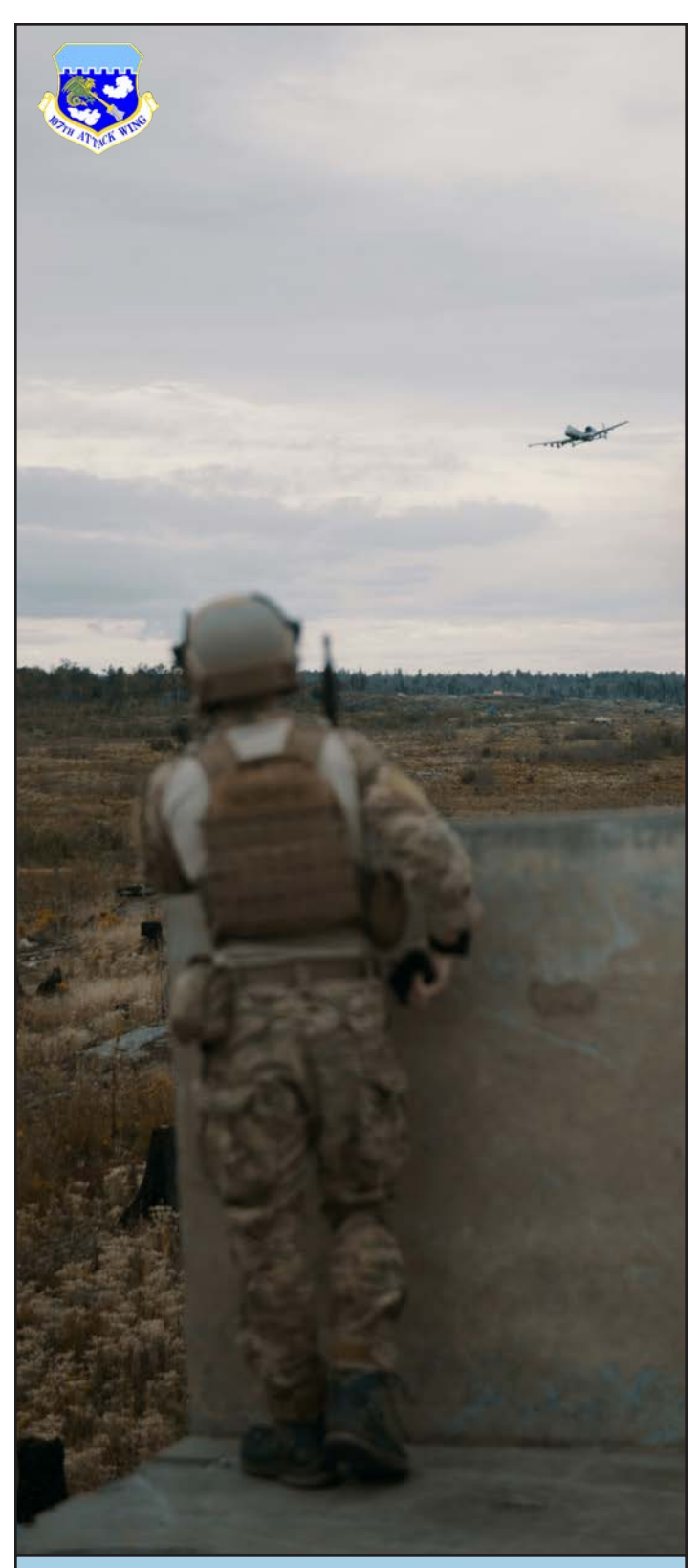
Airmen assigned to the 274th Air Support Operations Squadron, 107th Attack Wing, observe A-10 Thunderbolt IIs from the 124th Fighter Wing, Idaho Air National Guard, conduct a show of force during live-fire training scenarios at Fort Drum, N.Y., Sept. 20, 2018.