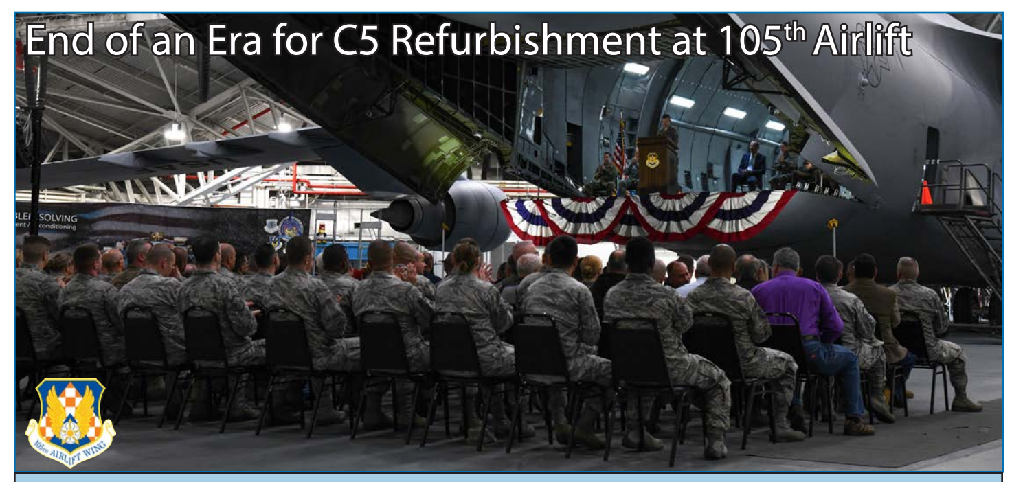
The 105th Airlift Wing holds a C-5M Super Galaxy closeout ceremony at Stewart Air National Guard Base, Nov. 1, 2018. The Wing refurbished 49 of 52 jets which will extend their capabilities into the 2040s.