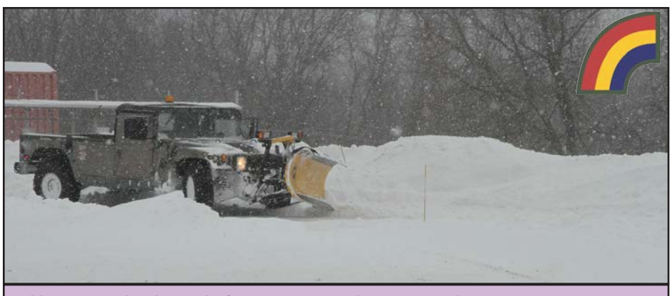
Soldiers assigned to the 42nd Infantry Division Headquarters' Initial Response Force in Troy, N.Y. clear snow from the armory Jan. 20, 2019 to be prepared to assist local responders during Winter Storm Harper as it passed through New York. The New York National Guard placed some 650 Soldiers and Airmen on duty to provide immediate response forces at locations across the state.

As the storm moved out of New York with no major incidents, the National Guard Soldiers and Airmen were released from duty on the afternoon of Jan. 20, 2019.