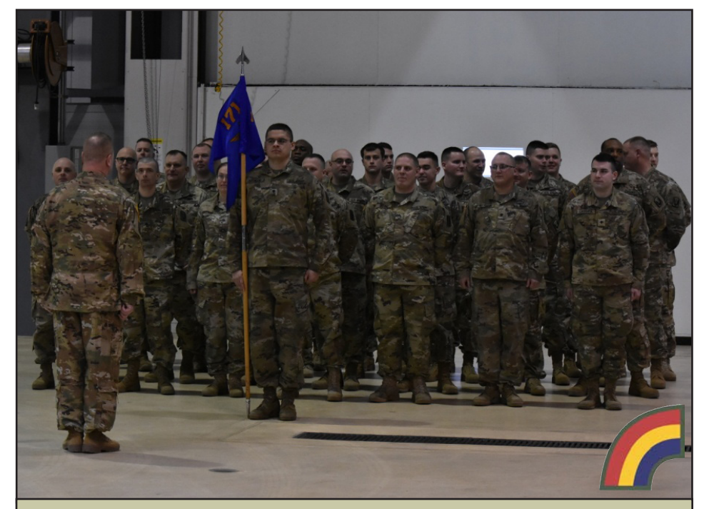
Soldiers of Charlie Company of 1st Battalion, 171st General Support Aviation stand in formation during their Yellow Ribbon Departure Ceremony, Rochester, N.Y., Jan. 2, 2019.

"Once you have children, and have more responsibilities...it affects everybody differently,"