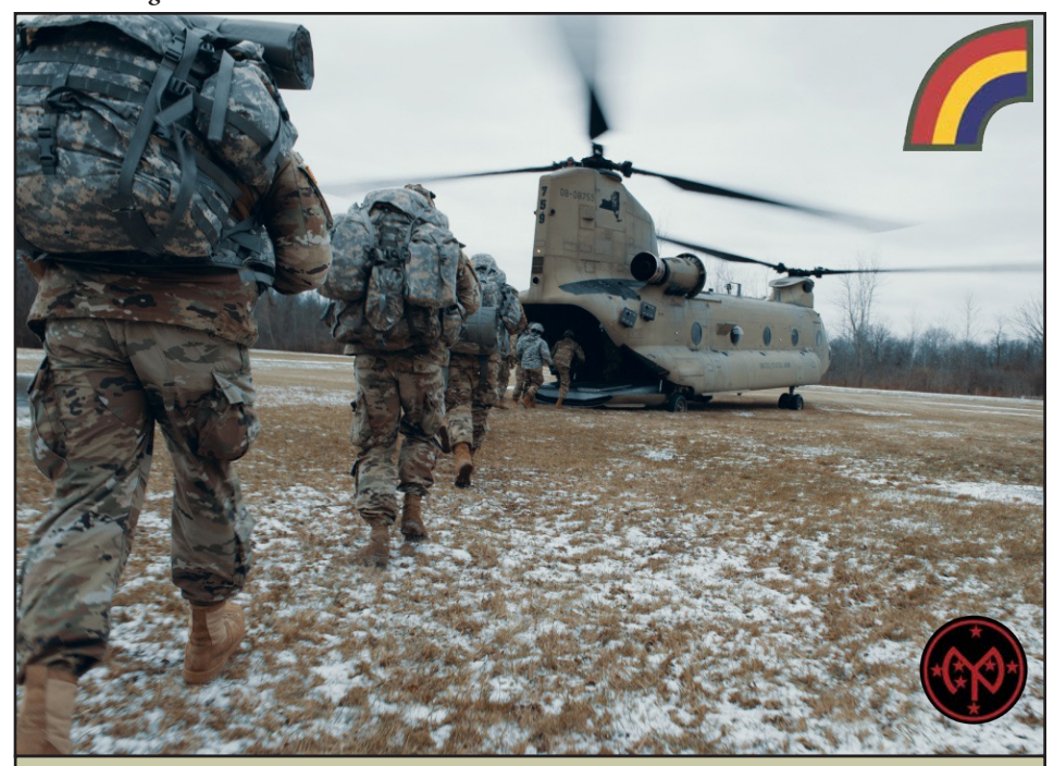
Soldiers assigned to Charlie Troop, 2nd Squadron, 101st Cavalry, from Buffalo, N.Y. rush to load a CH-47 Chinook helicopter from Bravo Company, 3rd Battalion, 126th Aviation based in Rochester during training at the National Guard training site in Youngstown, N.Y., Jan. 12, 2019.