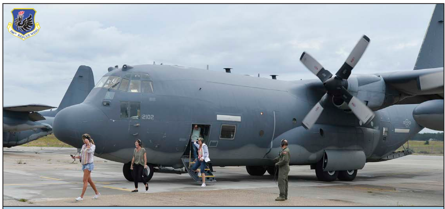
Spouses of 106th Rescue Wing members exit a C-130P/N King aircraft during a spouse flight at the 106th Rescue Wing in Westhampton Beach, N.Y., Sept. 8, 2018. The spouse flights were a part of the wing's Family Day festivities.