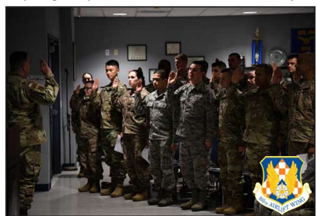
Members of the 105th Airlift Wing welcome 26 newly promoted staff sergeants at the non-commissioned officer's induction ceremony at Stewart Air National Guard Base, January 5, 2019.