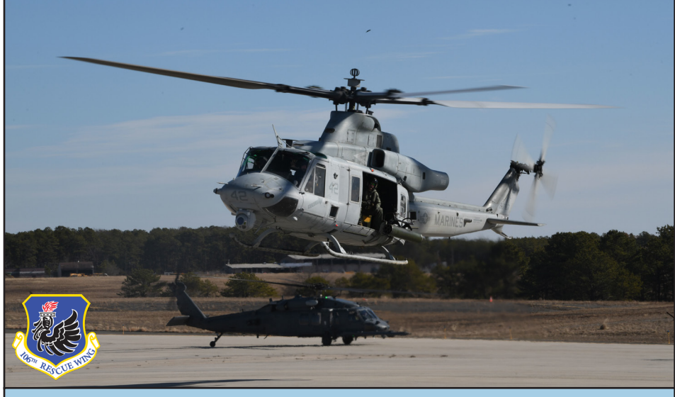
A Marine Corps UH-1Y Venom assigned to Marine Light Attack Helicopter Squadron 773 from Marine Aircraft Group 49, takes off during a training exercise alongside an HH-60G Pave Hawk assigned to the 101st Rescue Squadron at Francis S. Gabreski Air National Guard Base in Westhampton Beach, New York, Feb. 2, 2023.

"The FARP exercise allows us to practice something that's kind of non-standard for us. Just another option to have overseas for flexibility, getting fuel from another rotary-wing aircraft, potentially at a remote site where otherwise, it may not be possible to accomplish