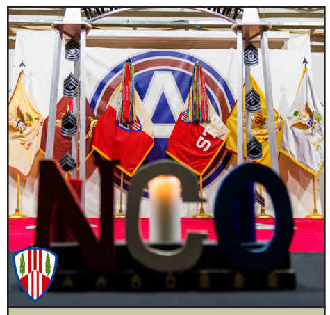
An arch made by Soldiers with the 783rd Support Maintenance Company, Task Force Red Ball, stands tall for non-commissioned officers to walk through during an NCO Induction ceremony held at Camp Buehring, Kuwait, Feb. 18, 2023.

But the regiment distinguished itself and became known as the Harlem Hellfighters for their determination in battle.