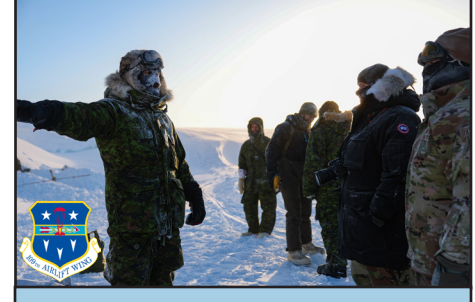
Airmen from the 139th Aeromedical Evacuation Squadron visit an arctic survival training camp in Resolute Bay, Nunavut, Canada, Feb. 23, 2023.

While the 139th has experience working in