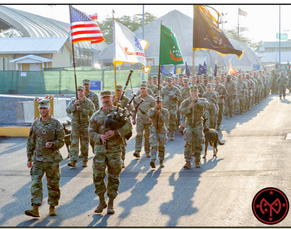
Soldiers of the 1st Battalion, 69th Infantry Regiment, on duty in the Horn of Africa, mark St. Patrick's Day parading through Camp Lemonnier, Djibouti, March 17, 2023.

In both places, Soldiers placed springs of boxwood in their uniforms in commemoration of the 69th's role in the Civil War during the December 1862 Battle of Fredericksburg. Soldiers of the Irish Brigade placed green boxwood sprigs on their blue uniforms to show that they were Irish before assaulting the Confederate positions.