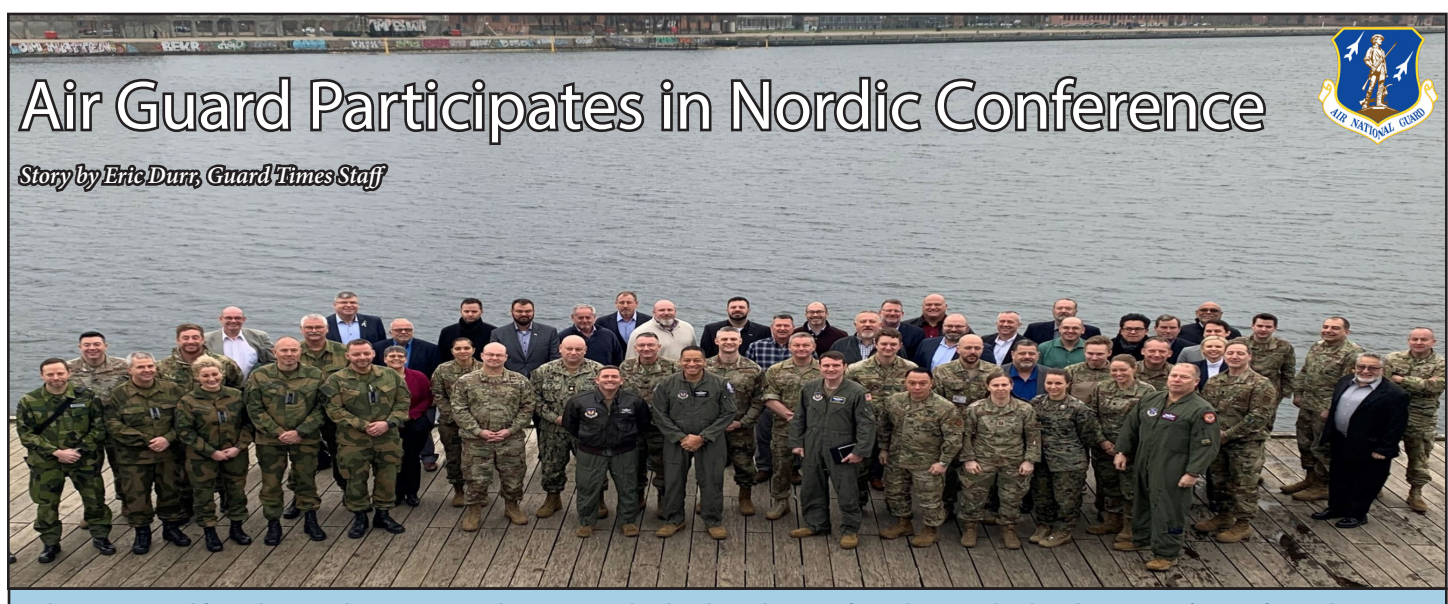
Mllitary personnel from the United States, Denmark, Norway, Finland and Sweden pose for a photograph taken during a conference focused on sharing airspace information in Copenhagen, Denmark, January 2023.

COPENHAGEN, Denmark — Three New York Air National Guardsmen who specialize in planning and executing air war campaigns took part in a four-day workshop in January designed to ensure that the militaries of Denmark, Norway, Sweden and Finland all know what's flying in the skies above their region.