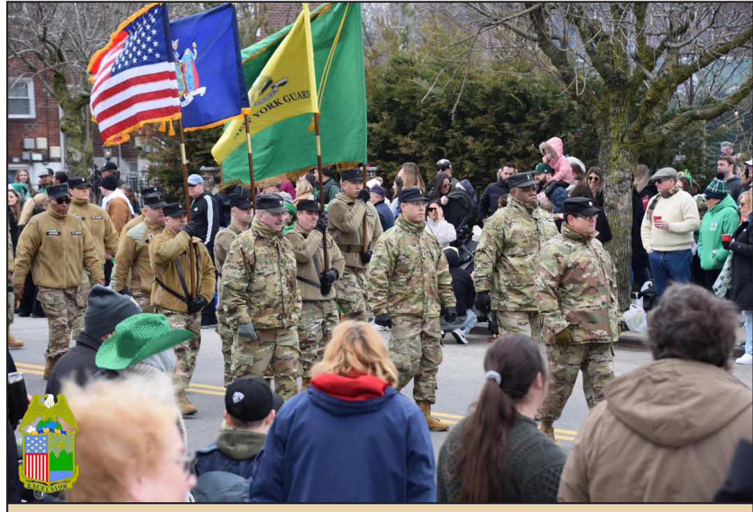
Members of the New York Guard's 88th Area Command march in the Queens County St. Patrick's Day Parade in Rockaway Beach on March 4, 2023.

"Given that our military lineage traces back to the Civil War Irish Brigade, it is appropriate that we