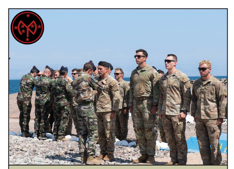
New York Army National Guard service members are presented with the French Desert Commando Badge during a ceremony following the completion of the French Desert Commando Course at the Centre Dentrainment Au Combat Djibouti, Feb. 2, 2023.

they completed a ruck run and an intense water obstacle course before beginning the week-long commando training.