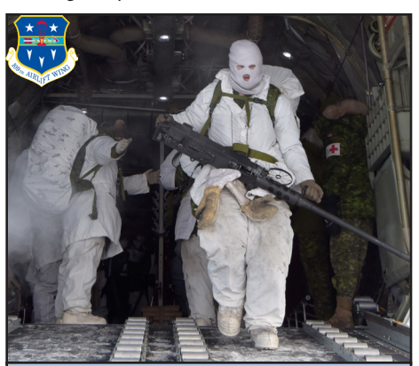
U.S. Army and Canadian soldiers offload an LC-130 Hercules flown by the 109th Airlift Wing during Guerrier Nordique in Nunavut, Canada, March 15, 2023. Both the 105th and 109th Airlift Wings provided critical lift to the participating units from five state.