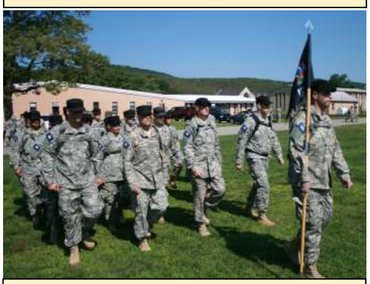
Soldiers of IET Class 2017-01 march onto the Parade Field during graduation at Annual Training 2017.