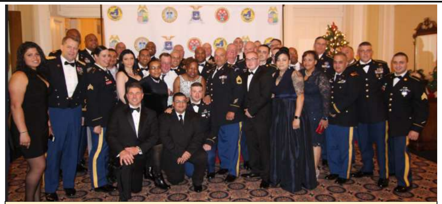
The New York Guard, together, at the New York Guard and the New York Naval Militia Annual Holiday Ball at West Point.