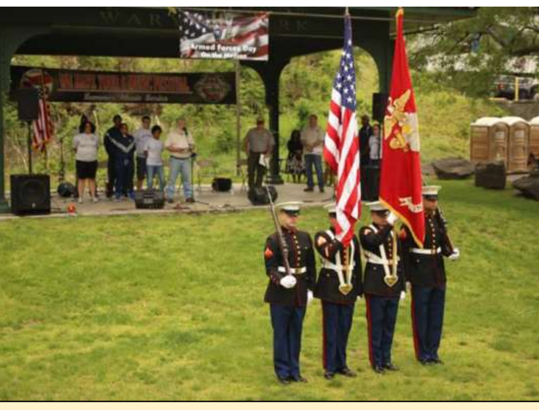
United States Marine Corps Color Guard during opening ceremonies, on 20 May 2017 in Poughkeepsie, NY.