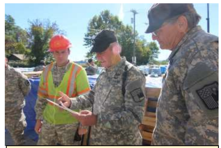
NY Guard NCOs on State Active Duty review inventory lists and discuss the plan for the day.

The mission is expected to continue as long as the volume of donations from the public warrant the New York Guard's logistical support, and will continue into 2018.