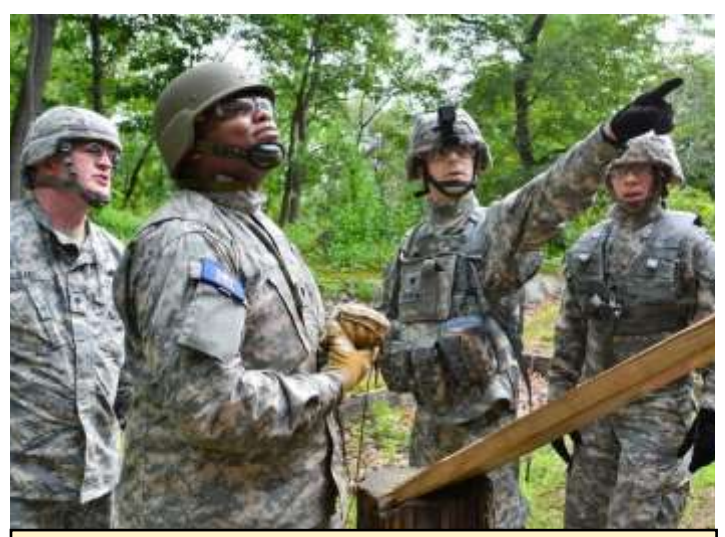
Soldiers of PLDC Class 2017-01 move through the Leadership Reaction Course at Camp Smith during Annual Training 2017.