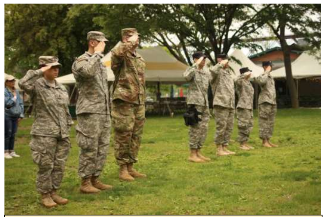
New York Guard soldiers and New York Army National Guard recruiters in formation during the National Anthem, on 20 May 2017 in Poughkeepsie, NY.