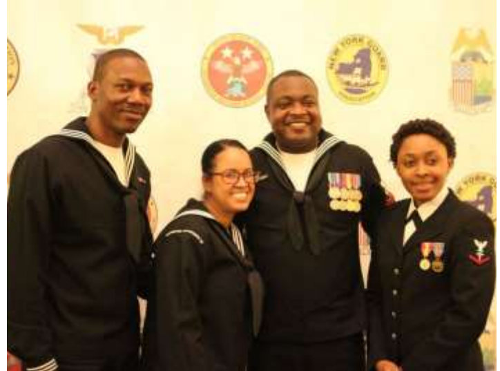
Sailors of the New York Naval Militia pose for photos at the Centennial Ball.