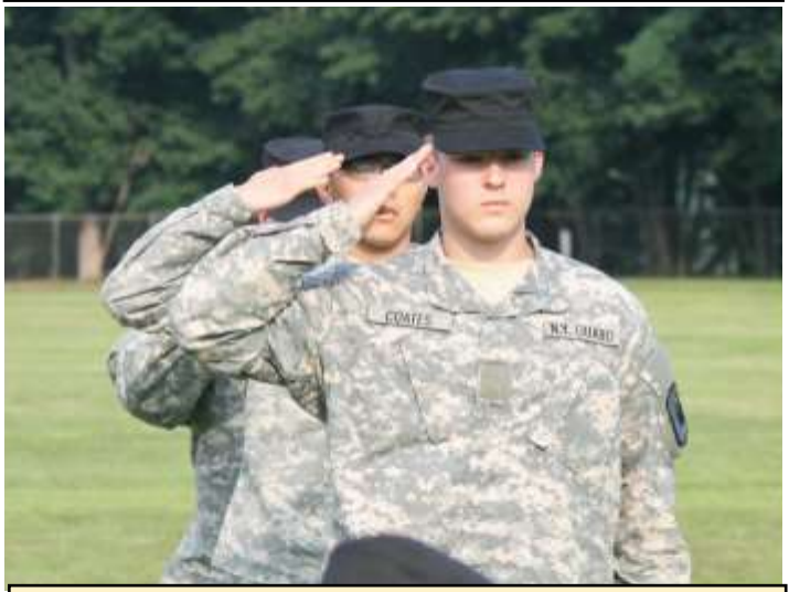
Soldiers of IET Class 2017-01 conduct D&C during the Drill Down competition at Annual Training 2017.