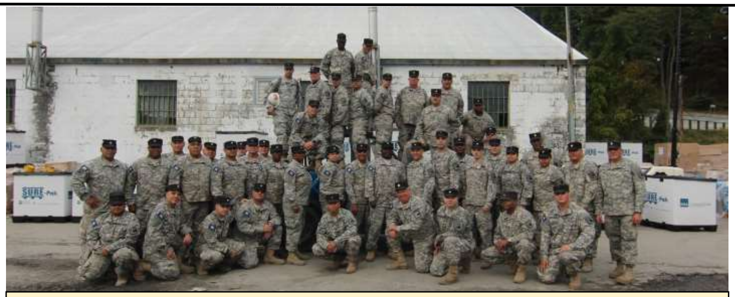
New York Guard soldiers on State Active Duty in support of Hurricane Maria relief efforts pose for a group photo at Camp Smith during a warehouse shift change. To date, more than 75 New York Guard soldiers have served on this extended activation alongside the New York Army National Guard and New York Naval Militia.