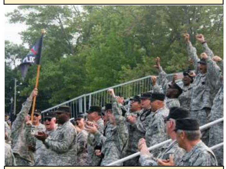
Soldiers of PLDC Class 2017-01 celebrate a victory during the Drill Down at Annual Training 2017.