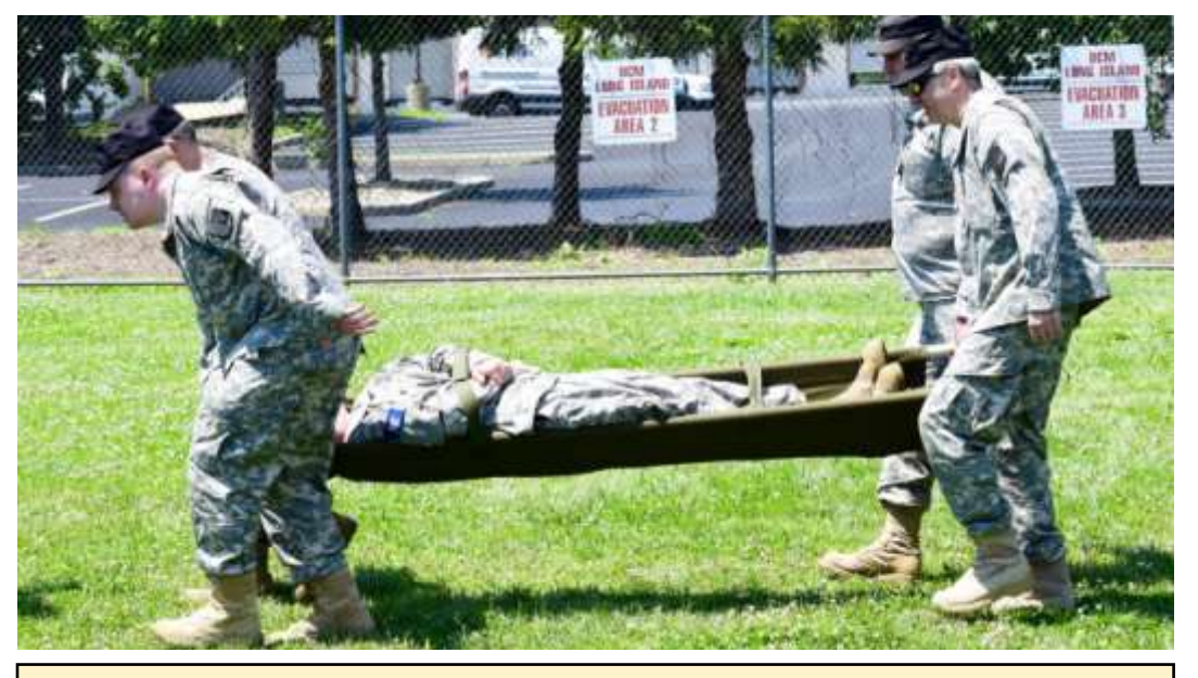
Soldiers of the 88th Area Command conduct a Mass Casualty Exercise concurrent to the 25 June MERNEX.

The motto of the US Army Signal Corps has not been lost on the New York Guard's 88AC MERN Unit – Pro Patria Vigilans or Watchful for the Country holds as true as ever.