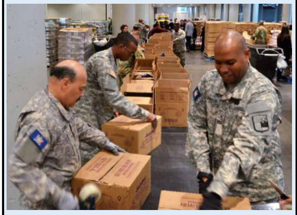
On November 20 and 21, soldiers and airmen from the New York National Guard Joint Task Force Empire Shield, along with soldiers from the NY Guard State 88AC, 56AC and Headquarters Company assisted in the preparing and packing of over 2800 boxes of Thanksgiving food at the Jacob Javits Center in Manhattan as part of Governor's Office NY Holiday Giving event.