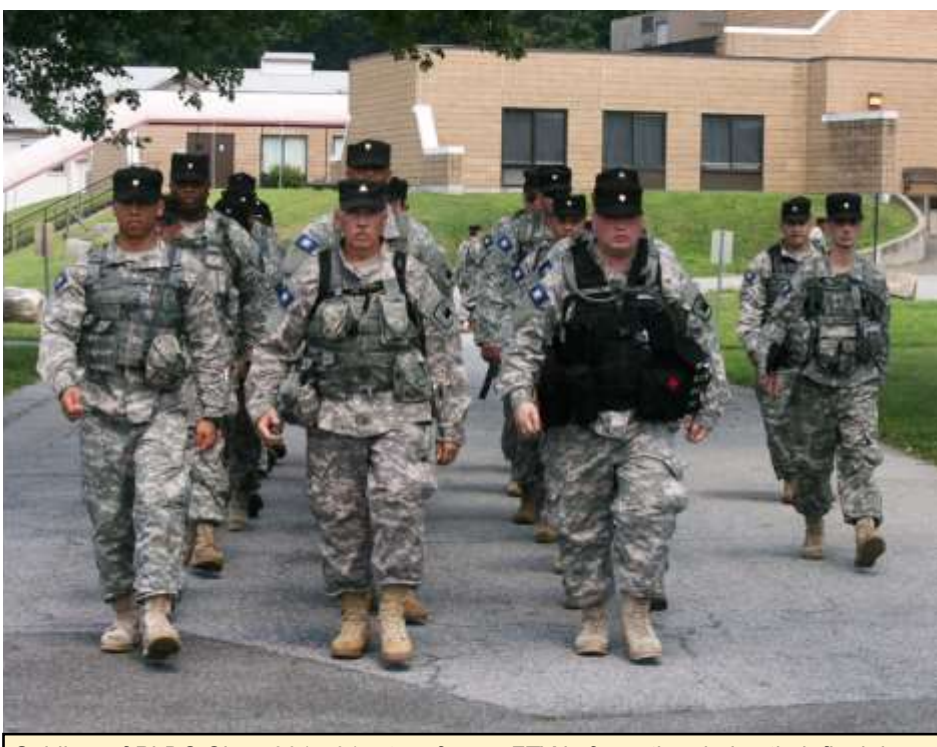
Soldiers of PLDC Class 2017-01 return from a FTX in formation during their final days of the Primary Leadership Development Course.

The New York Guard is a force of 500 uniformed volunteers, organized as a military unit, who augment the New York National Guard during state emergencies. They provide administrative and logistics support to the National Guard.