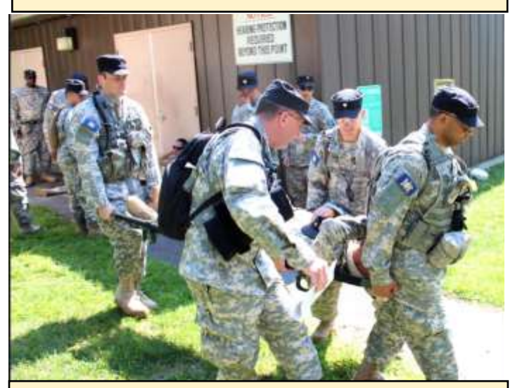
Soldiers of PLDC Class 2017-01 conduct a Mass Casualty Exercise during their FTX at Annual Training 2017.