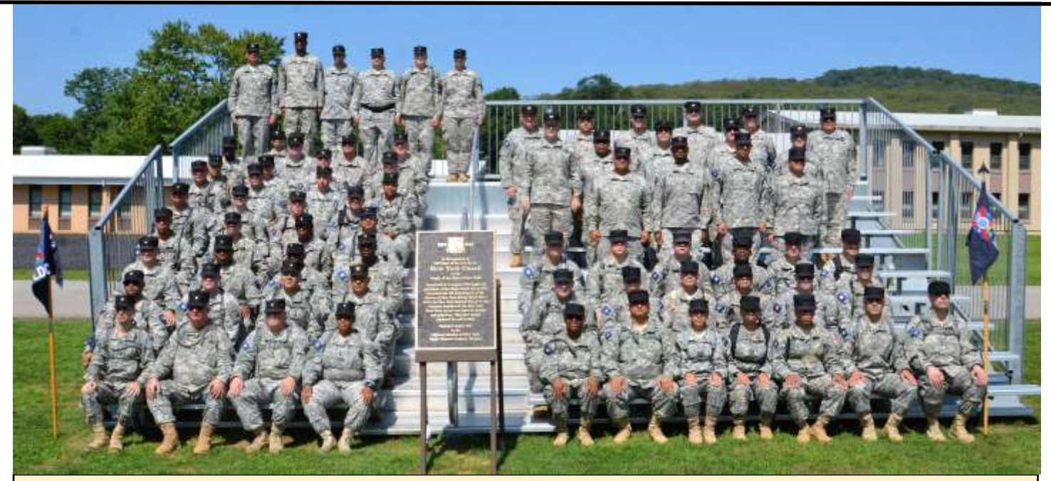
The New York Guard graduates of Primary Leadership Development Course (PLDC) 2017-01 and Initial Entry Training (IET) 2017-01 pose for a graduation photo with 12th RTI Cadre and Headquarters Staff."

zens, with 9/11, Hurricane Sandy in 2012 and most recently this summer assisting with filling sand bags and providing assistance to the National Guard, where needed with the flooding upstate in Lake Ontario. I appreciate all you do for New York State and its Citizens."