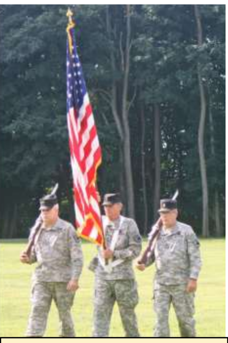
Color Guard members take to the parade field to rehearse for the Centennial Celebration during Annual Training 2017.