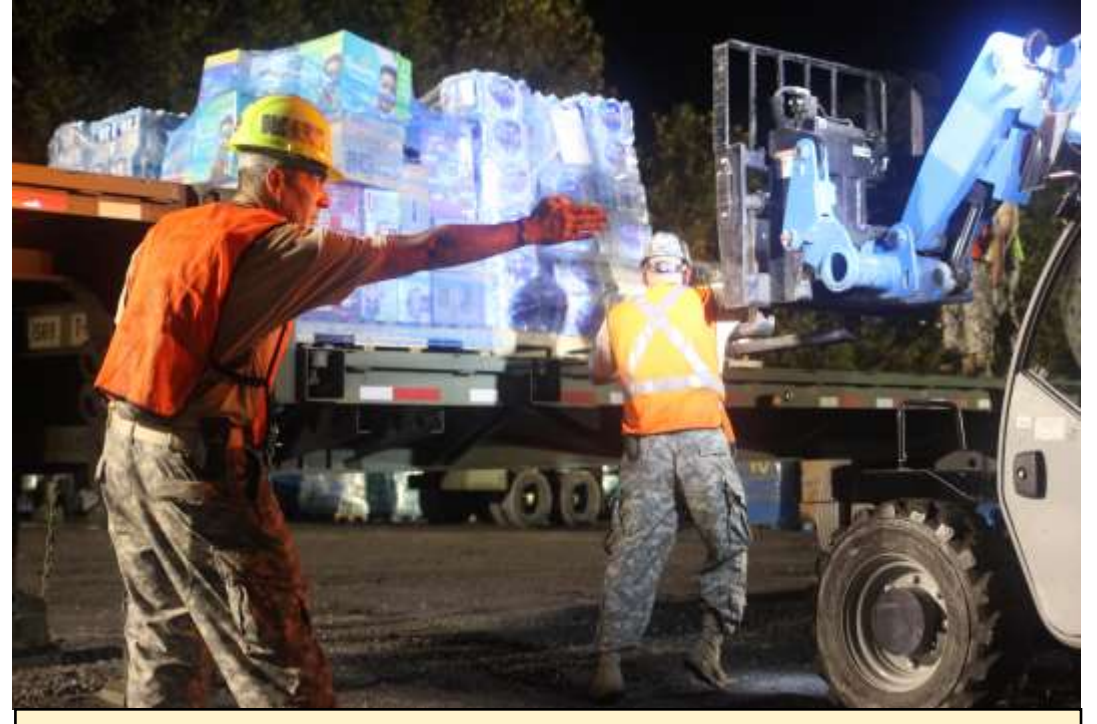
New York Guard members load bottled water donated by people across the state for Puerto Rico relief onto a flatbed at Camp Smith Training Site on Oct. 9. Seventy New York Guard members have been placed on State Active Duty to help package and process donations.

Since day one, the New York Guard and Army National Guard efforts have been a 24-hour operation, working around the clock to consoli-