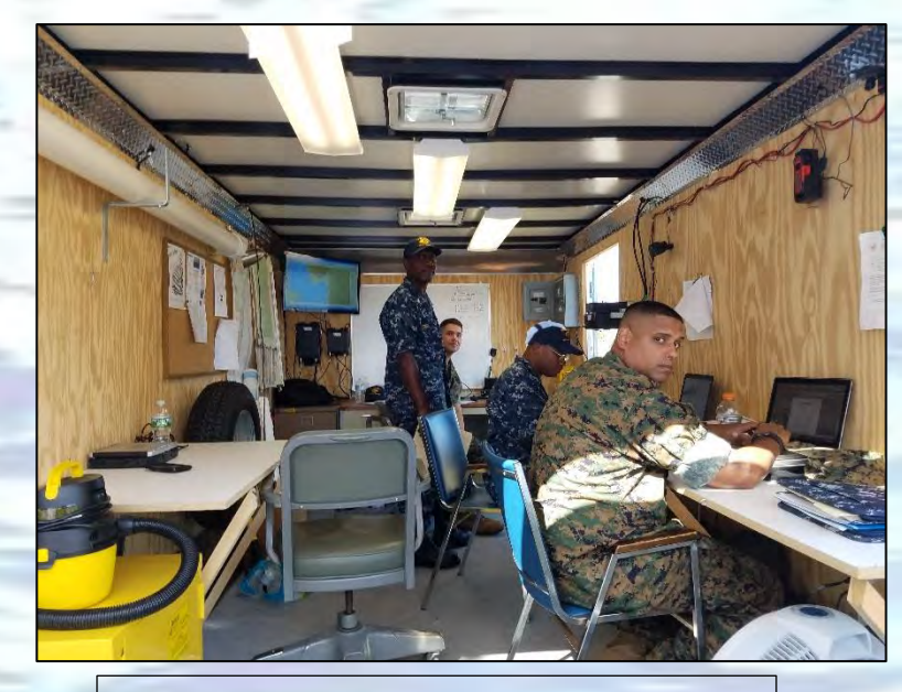
MEBS Command Post

necessitating a "first wave" of Naval Militia members.