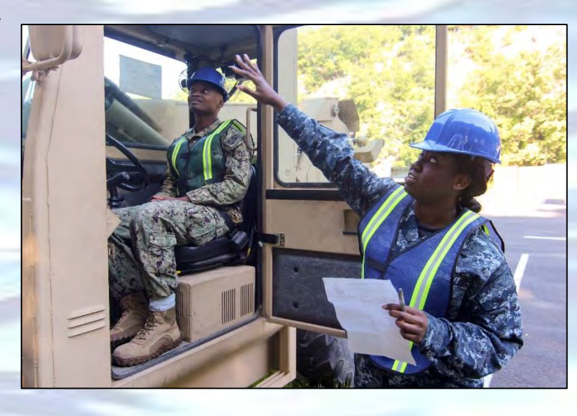
Rapid Gunwale '16 Expeditionary Logistics Support Team Forklift Training