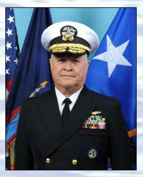
Rear Admiral (LH) Ten Eyck B. Powell, III NYNM