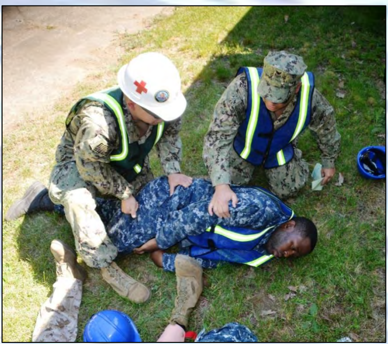
Medical Response Group Training