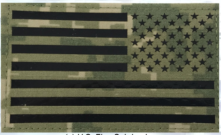
(a) U.S. Flag Subdued

Subdued (b) NY Naval Militia patches are available from NY Naval Militia Headquarters at (518) 786-4583.