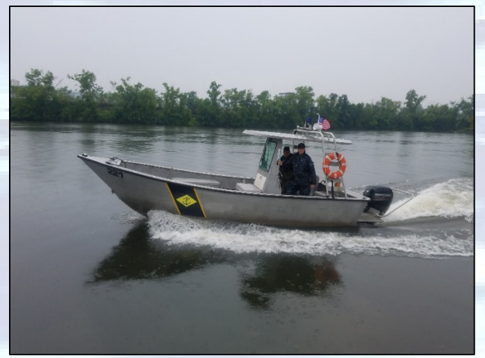
PB 221 with SWCS Rogers and IT1 Aldershoff embarked during landing craft training on 17AUG18.

The 2018 grant will support equipment acquisition for LC 350 as well as major rehabilitation work for PB 440.