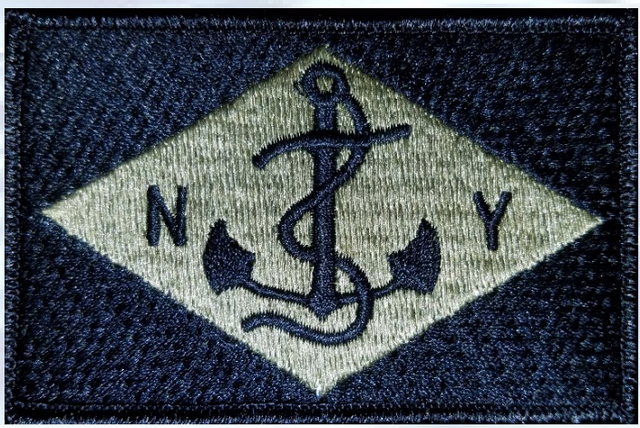
(b) NY Naval Militia Subdued Patch