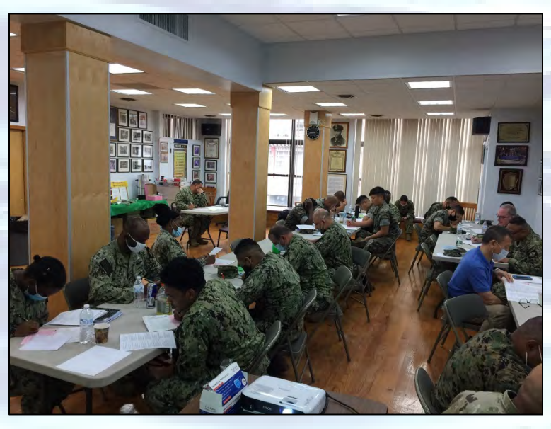
NYNM members and civilians take the NYS Safe Boater Exam at American Legion Post 1291 in New York City, on 29 July 2021.

The Training Officer (N7) provides periodic reports on Naval Militia training readiness. Our latest snapshot of readiness is found on the next to last page of this NEWSLETTER.