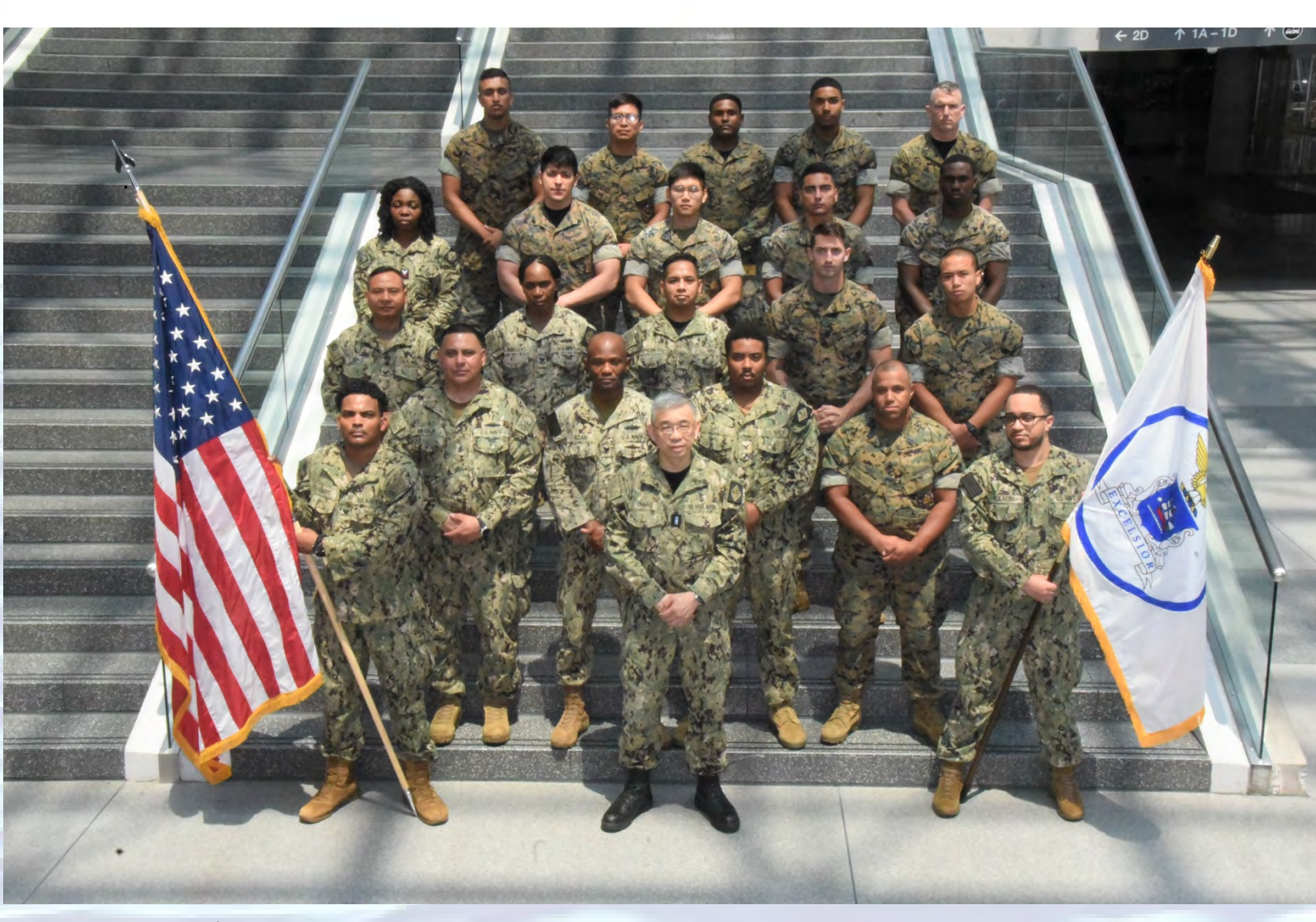
Members of the N.Y. Naval Militia Detachment assigned to Task Force Javits pose together prior to REFRAD, at the Javits Center on 15JUL21.