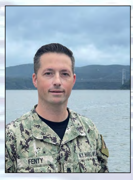
N.Y. Naval Militia Unit of the Year