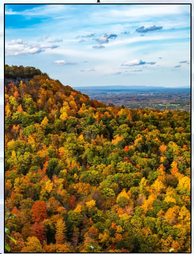
The Helderberg Escarpment, October 2022