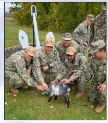
Naval Militia members on SAD at Latham headquarters celebrate the birthday of the U.S. Navy on October 13<sup>th</sup>.