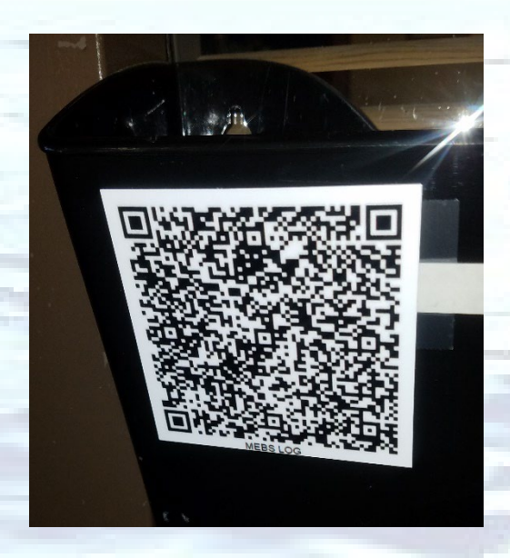
Link to MEBS LOG App:

https://www.jotform.com/app/build/222037196822152