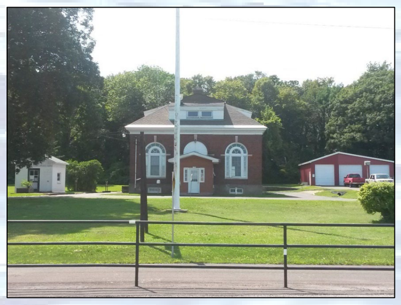
Dunkirk Armory in 2014.

After a proposal in 1937, the Dunkirk armory was created at the expense of $250,000 to replace the rented quarters which previously housed the division. Beforehand, the division was located at the Heyl building, at 220 Central Avenue in Dunkirk, which was damaged by a fire on April 25, 1932.