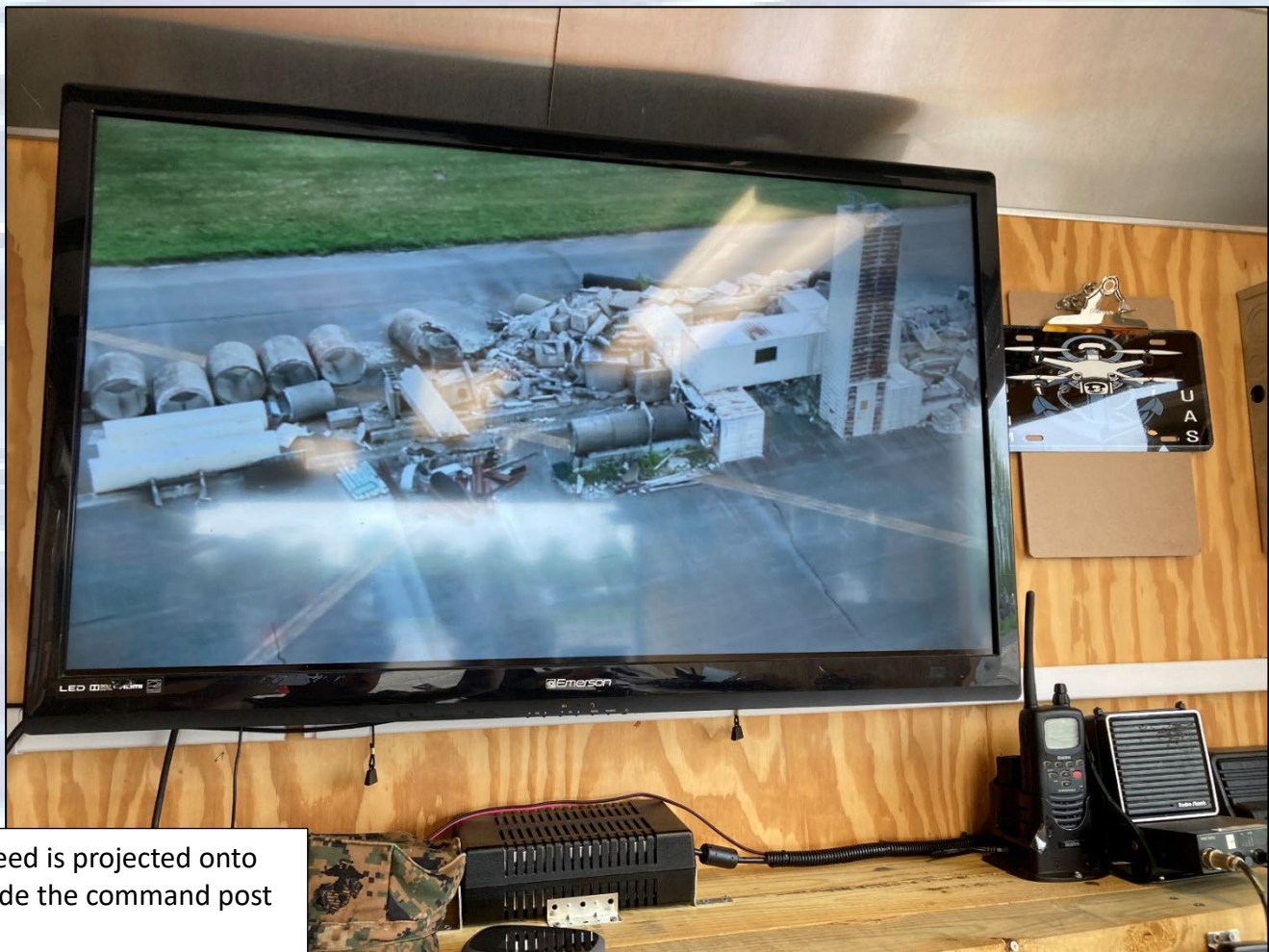
The UAV live-feed is projected onto the screen inside the command post trailer.