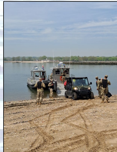
The 24 th Civil Support Team, based at Fort Hamilton, conducts a rehearsal embarking their Polaris onboard LC 350 at Davids Island in western Long Island Sound, on 2MAY2025.