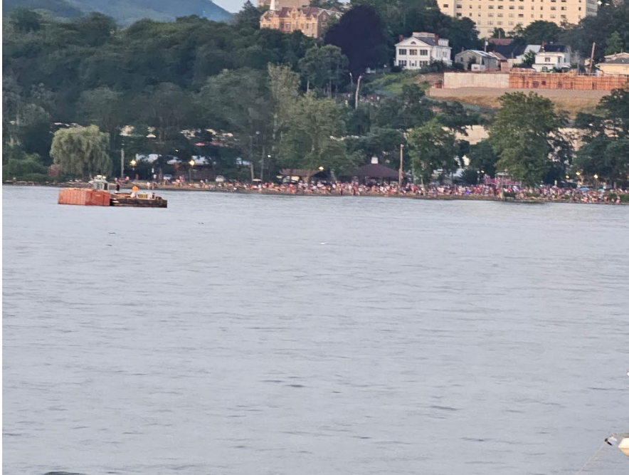
4 th of July fireworks display at Peekskill. From MEBS Det 1.

i. DET 1 Indian Point Activity: Federal Safety and Security Zone Patrol/Lower Hudson River Patrol.