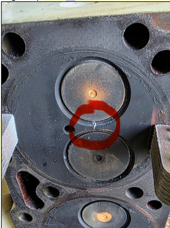
(L) Crack in cylinder head.

a. The engine work on PB400 continues. The fuel tank has been cleaned, and significant amounts of detritus were removed. During the engine tear-down, cracks in cylinder heads were found between the 1 st exhaust and intake valves were found on both the port and starboard engines. The vendor has plans to have the cylinder heads pinned and welded. This growth work will also include replacement of the fuel lines and will require a change notice to the purchase order. The boat cannot reasonably be expected to be functional without this additional work being completed.