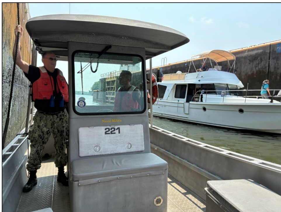
DET 33 headed west at Lock 9 of the Erie Canal on 8AUG25.