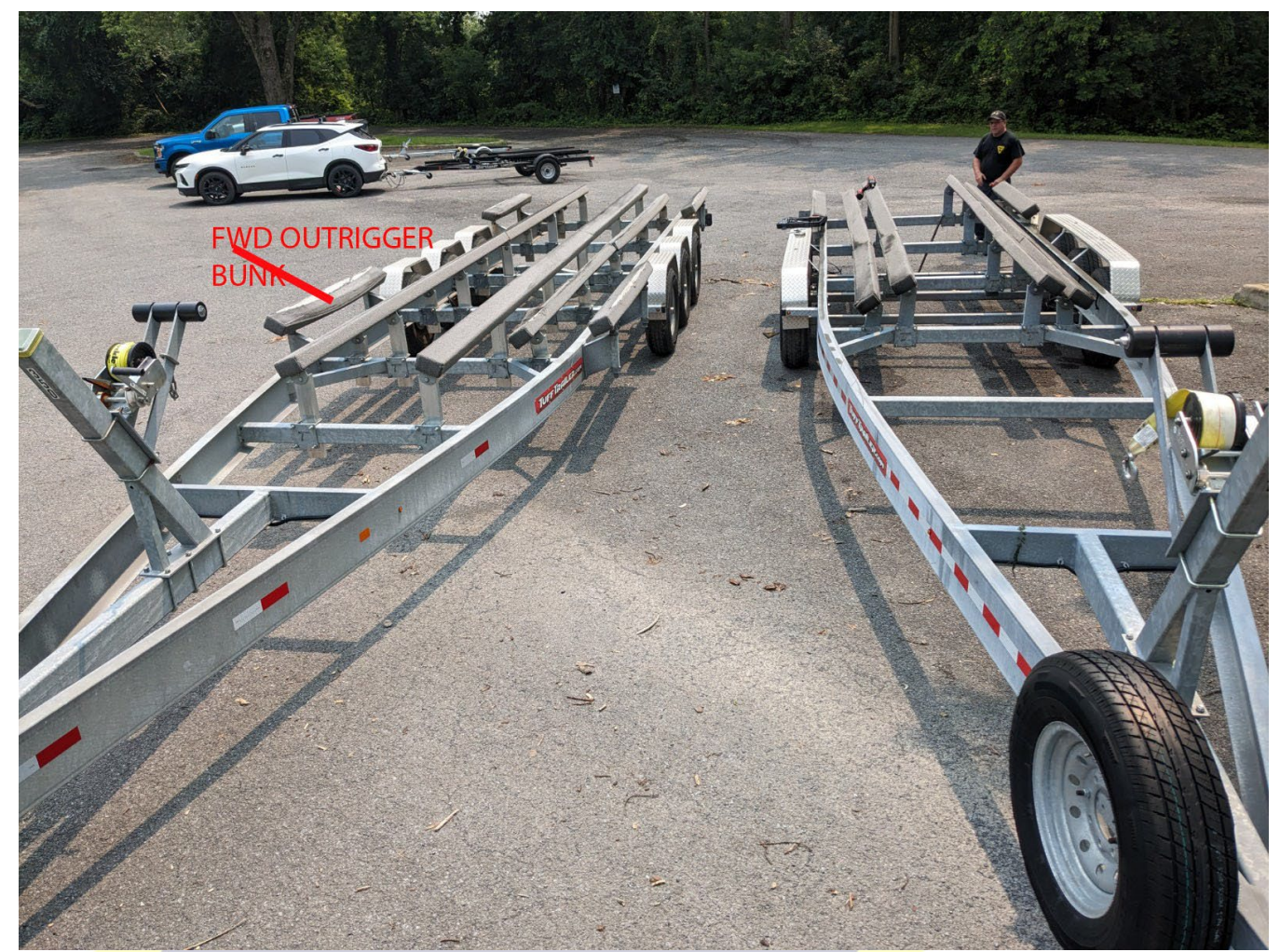
OLD (LC 350 2018 Tuff Trailer)

ii. As reported last week, we have struggled to properly load LC 351 onto its trailer at boat ramps. On 17JUL, we launched the boat so that we could examine the trailer against its sister from LC350. Although the two boat hulls are identical, the Tuff Trailers are not. We reached out to Munson Boats who initially provided the Tuff Trailers. They agree that additional support on the LC 351 trailer is needed and we are providing trailer specs so that they can procure and send trailer bunk outriggers. Jesse Munson did comment that most of their customers with large vessels such as ours typically load the boats onto trailers using a travel lift. The fact that we often load the trailers at a boat ramp is not typical. One of the additional measures we will take is to add bunk slicks to both trailers to ease loading. LC 351 is currently on the LC 350 trailer and will remain so until the upgrades are made to the newer trailer.