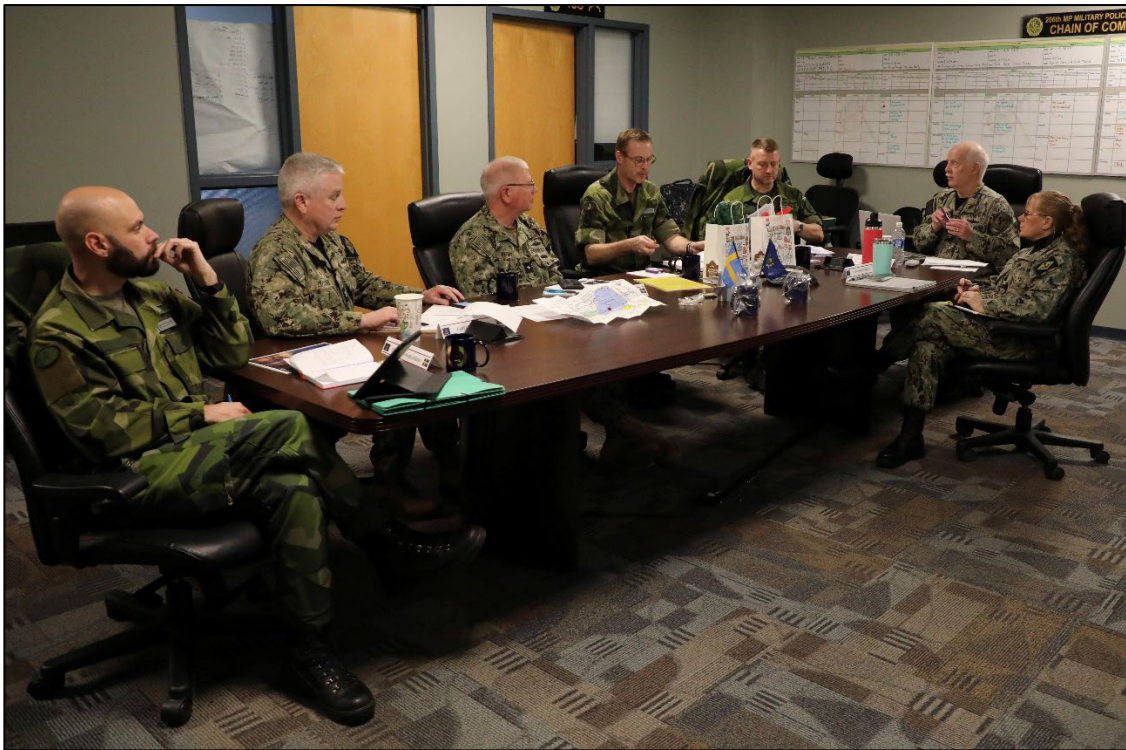
NYNM Leadership in staff talks with Swedish Navy Marines on 27 FEB25.

6) COMMUNICATIONS. The Commander, NYNM has approved the proposal to transition the MEBS command post and assets to the NYNM UAS unit as a combined maritime domain awareness capability. This transition is starting and should be completed by the end of June 2025.