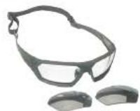
REVISION SHADOWSTRIKE NSN: 4240-01-678-6969