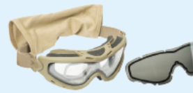
WILEY X SPEAR THERMAL NSN: 4240-01-678-6131 UPLC COMPATIBLE

This eyewear provides ballistic protection and enhanced resistance to fog in cold weather environments, increasing the operational longevity for Soldiers in those environments.