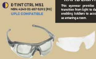
E-TINT CTRL M51 NSN: 4240-01-657-5202 (RO) UPLC COMPATIBLE