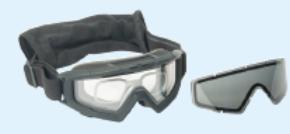
REVISION SNOWHAWK NSN: 4240-01-678-2516 (BLACK) NSN: 4240-01-678-6120 (TAN) UPLC COMPATIBLE